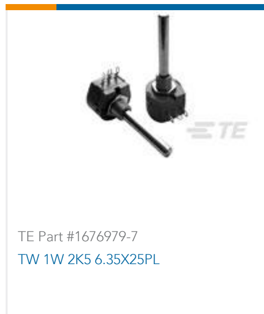
TE Part #1676979-7 TW 1W 2K5 6.35X25PL