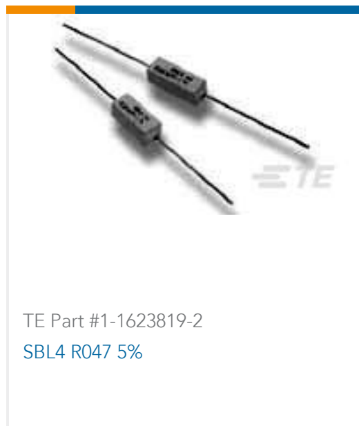
TE Part #1-1623819-2 SBL4 R047 5%