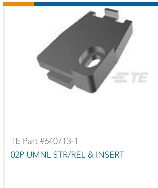
TE Part #640713-1 02P UMNL STR/REL & INSERT