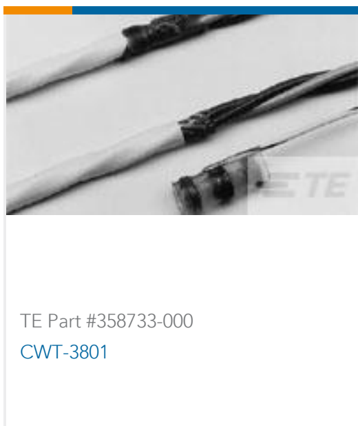
TE Part #358733-000 CWT-3801