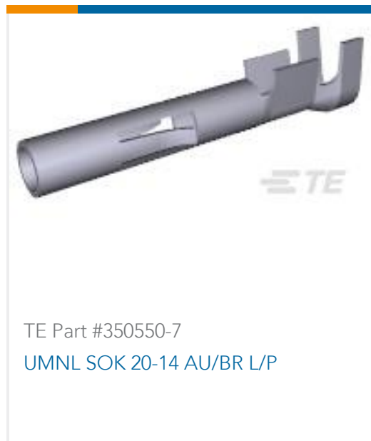
TE Part #350550-7 UMNL SOK 20-14 AU/BR L/P