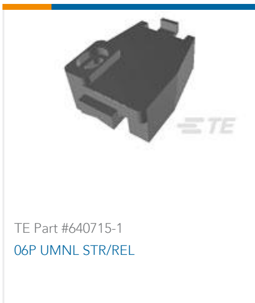
TE Part #640715-1 06P UMNL STR/REL