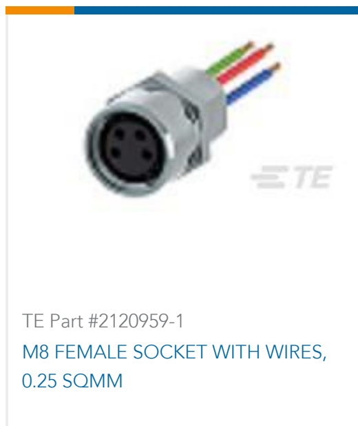
TE Part #2120959-1 M8 FEMALE SOCKET WITH WIRES, 0.25 SQMM