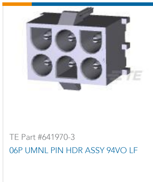
TE Part #641970-3 06P UMNL PIN HDR ASSY 94VO LF