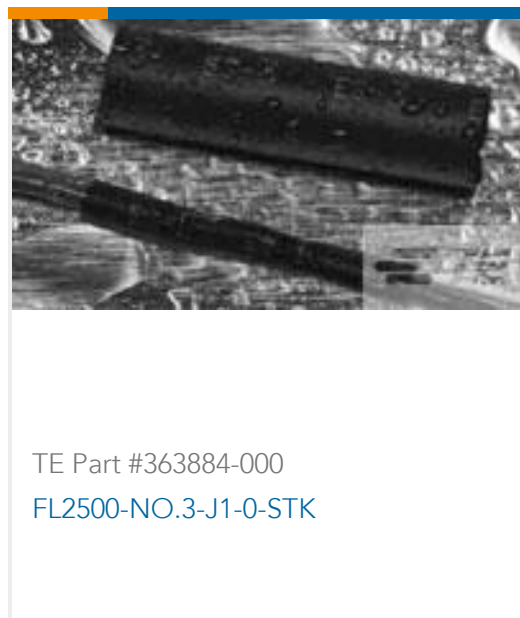
TE Part #363884-000 FL2500-NO.3-J1-0-STK