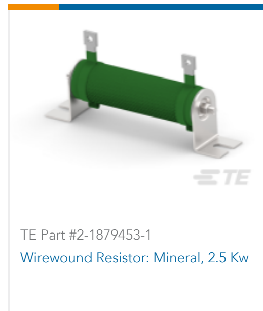
TE Part #2-1879453-1 Wirewound Resistor: Mineral, 2.5 Kw