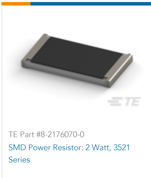
TE Part #8-2176070-0 SMD Power Resistor: 2 Watt, 3521 Series