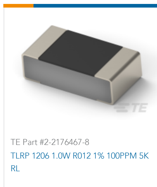
TE Part #2-2176467-8 TLRP 1206 1.0W R012 1% 100PPM 5K RL