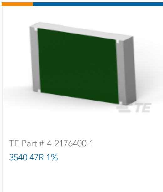
TE Part # 4-2176400-1 3540 47R 1%