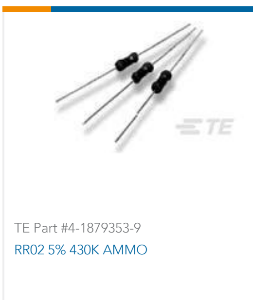
TE Part #4-1879353-9 RR02 5% 430K AMMO