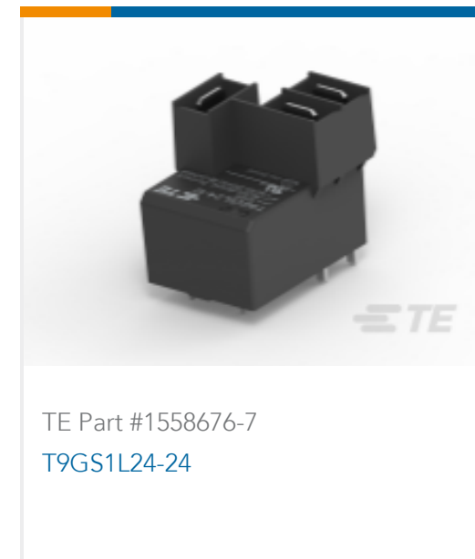
TE Part #1558676-7 T9GS1L24-24