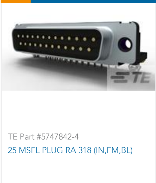
TE Part #5747842-4 25 MSFL PLUG RA 318 (IN,FM,BL)