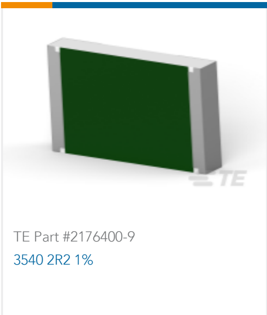
TE Part #2176400-9 3540 2R2 1%