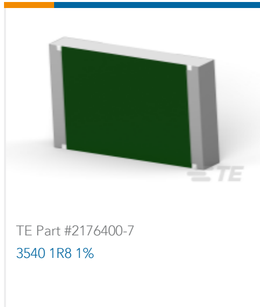
TE Part #2176400-7 3540 1R8 1%