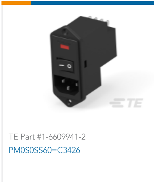
TE Part #1-6609941-2 PM0S0SS60=C3426