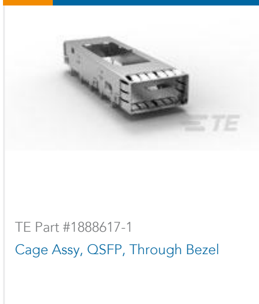
TE Part #1888617-1 Cage Assy, QSFP, Through Bezel