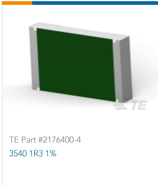
TE Part #2176400-4 3540 1R3 1%