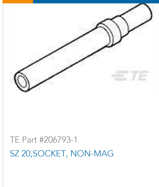
TE Part #206793-1 SZ 20, SOCKET, NON-MAG