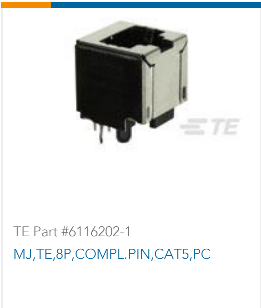
TE Part #6116202-1 MJ,TE,8P,COMPL.PIN,CAT5,PC