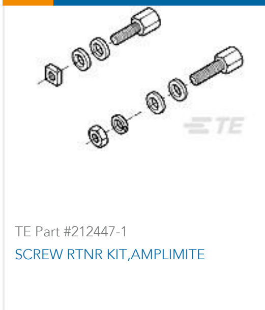
TE Part #212447-1 SCREW RTNR KIT,AMPLIMITE