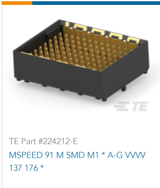
TE Part #224212-E MSPEED 91 M SMD M1 * A-G VVV 137 176 *