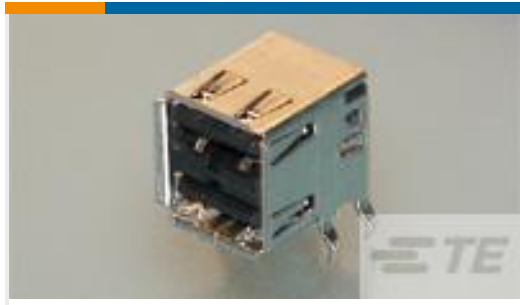
TE Part #292323-5 RECEPTACLE ASSY RIGHT ANGLE STACKED THRU