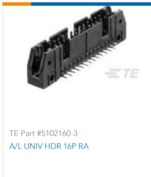
TE Part #5102160-3 A/L UNIV HDR 16P RA