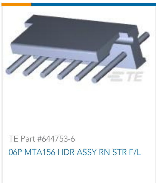
TE Part #644753-6 06P MTA156 HDR ASSY RN STR F/L