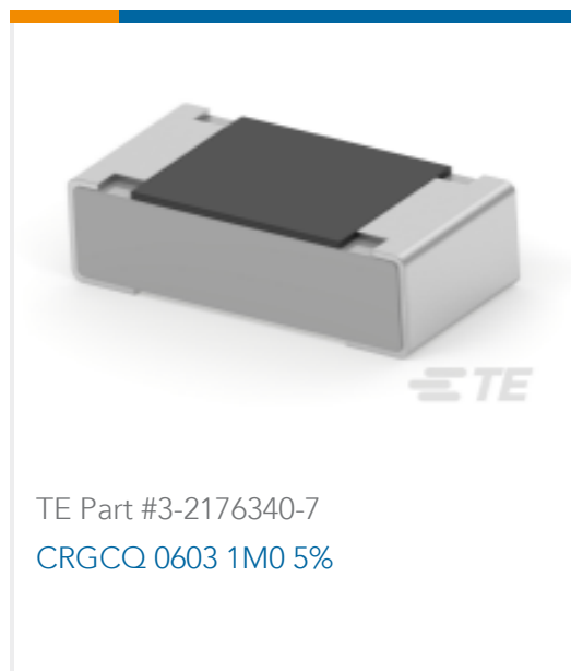
TE Part #3-2176340-7 CRGCQ 0603 1M0 5%