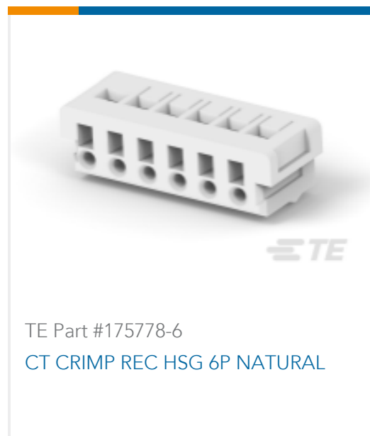
TE Part #175778-6 CT CRIMP REC HSG 6P NATURAL