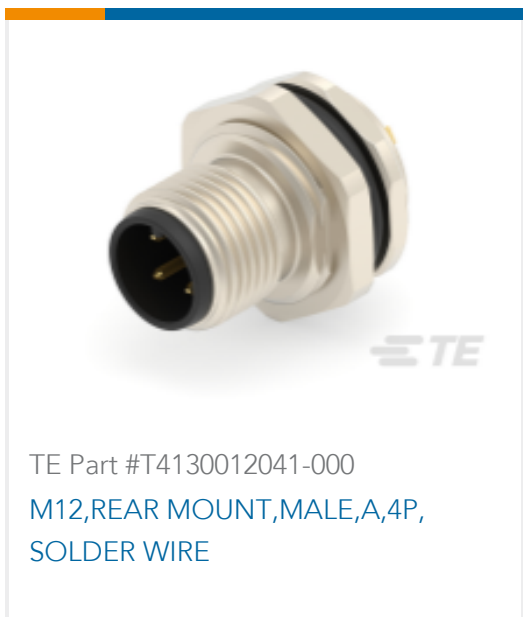
TE Part #T4130012041-000 M12,REAR MOUNT,MALE,A,4P, SOLDER WIRE