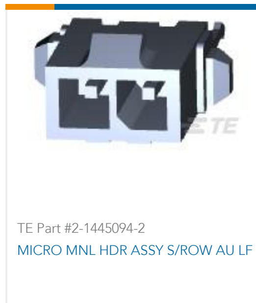
TE Part #2-1445094-2 MICRO MNL HDR ASSY S/ROW AU LF