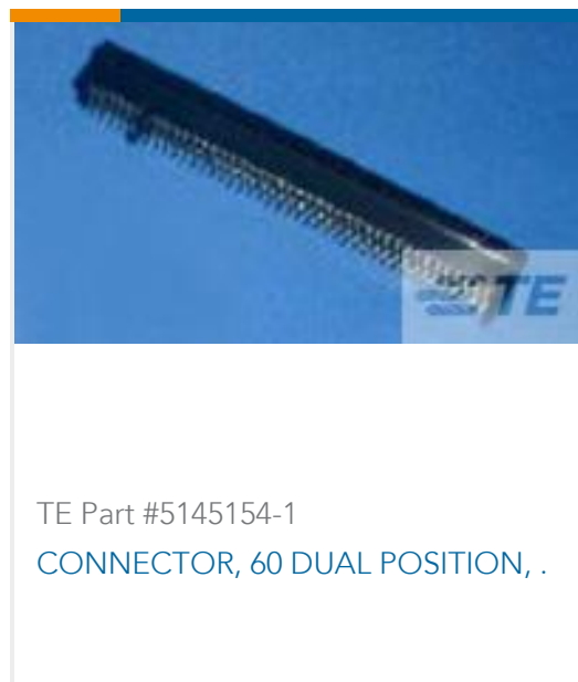
TE Part #5145154-1 CONNECTOR, 60 DUAL POSITION, .