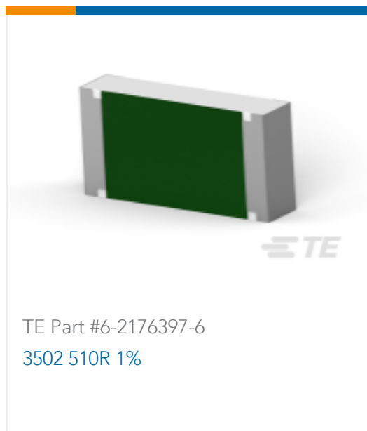
TE Part #6-2176397-6 3502 510R 1%