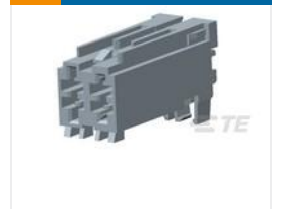
TE Part #293491-2 AMP MONO-SHAPE TAB CONN assy 2