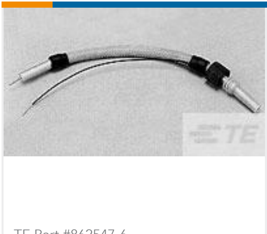
TE Part #862547-6 LEAD, SGL END ASSY, LGH