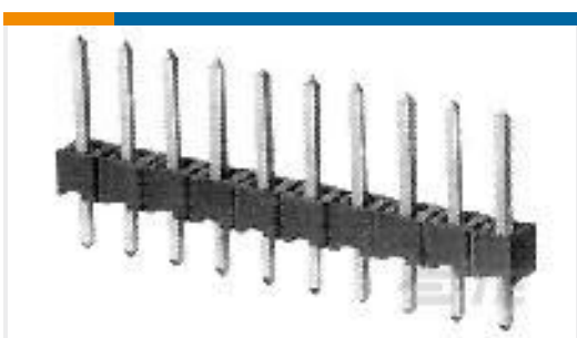
TE Part #826646-2 AMPMODU II R/A HEADER