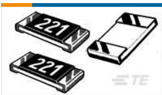
TE Part #2-2176230-6 3522 100R 5% 3W