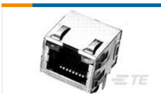
TE Part #2-406549-8 IMJ,1X1,PNL GRD,LED(YG/YG), SN