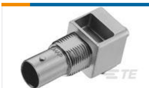
TE Part #5414907-1 JACK,PCB,75 OHM,NC