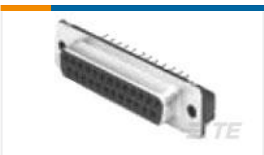
TE Part #5747150-2 09 RCPT SP/FMS STD