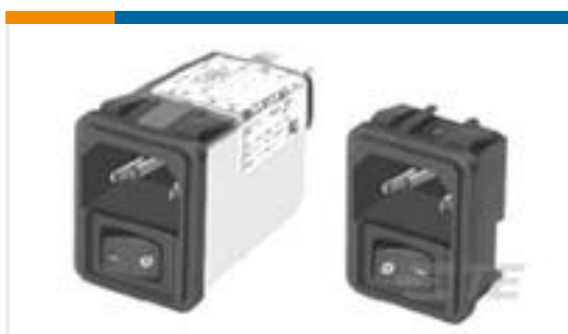
TE Part #1-6609113-3 10CFE1 S0=F7834