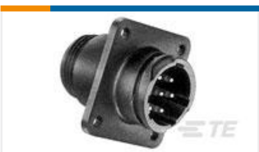
TE Part #211401-7 RECEPT,SZ 13-7,CPC