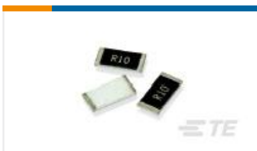
TE Part #1-2176057-6 RLP73M 3A R043 1% 1K RL