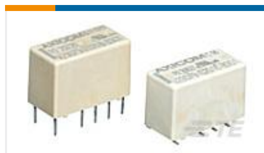
TE Part #6-1393788-9 V23079E1203B301