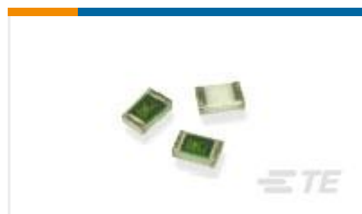
TE Part #3-2176090-5 RP 1J 0.166W 294K 0.1% 25PPM 1K RL