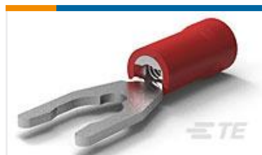
TE Part #53242-6 PG SPR SPD 22-16COM22-18MIL 10