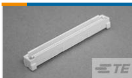
TE Part #1-5177986-3 0.8FH,P06H.5,080,08/Sn,TR,SC