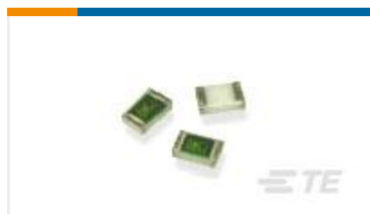
TE Part #2-1625868-8 RP 2A 0.25W 10R2 0.1% 25PPM 1K RL