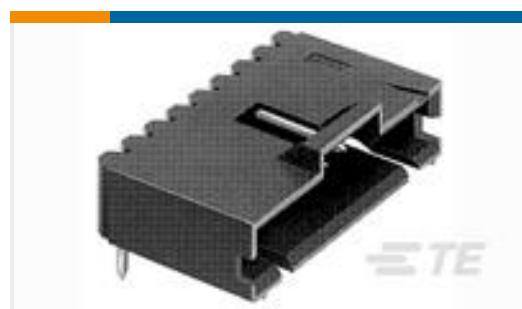
TE Part #103635-1 02 MTE HDR SRRA LATCH .100CL