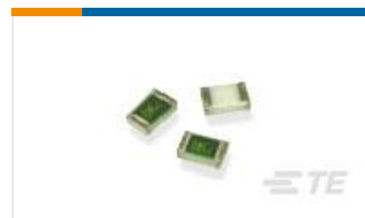
TE Part #7-1625868-7 RP 2A 0.25W 33R2 0.1% 25PPM 1K RL