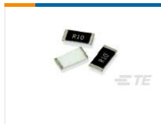
TE Part #4-2176057-9 RLP73K 3A 1R0 1% 1K RL