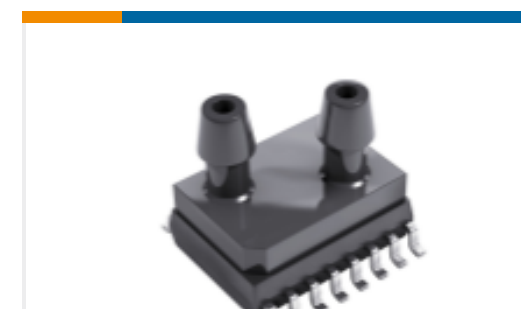
TE Part #9541-020C-S-C-3-S PRESSURE I2C 0.3 PSIG SO16