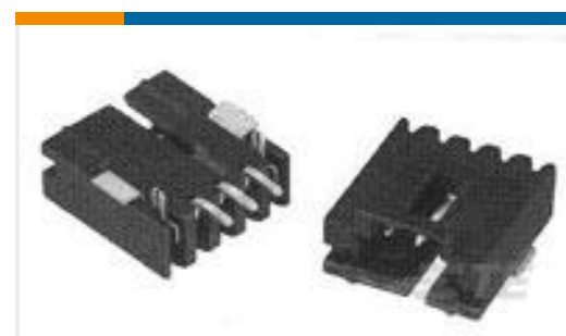
TE Part #5-147278-7 08 MTE HDR SRRA SFMNT .100CL