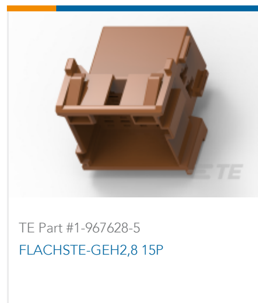
TE Part #1-967628-5 FLACHSTE-GEH2,8 15P