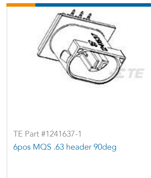
TE Part #1241637-1 6pos MQS .63 header 90deg