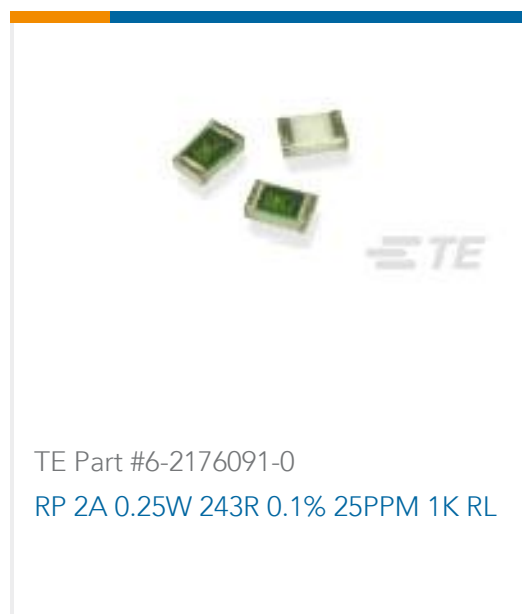
TE Part #6-2176091-0 RP 2A 0.25W 243R 0.1% 25PPM 1K RL