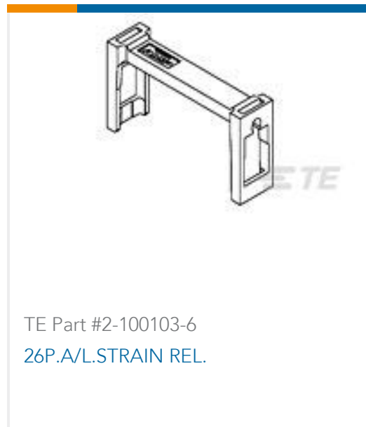
TE Part #2-100103-6 26P.A/L.STRAIN REL.