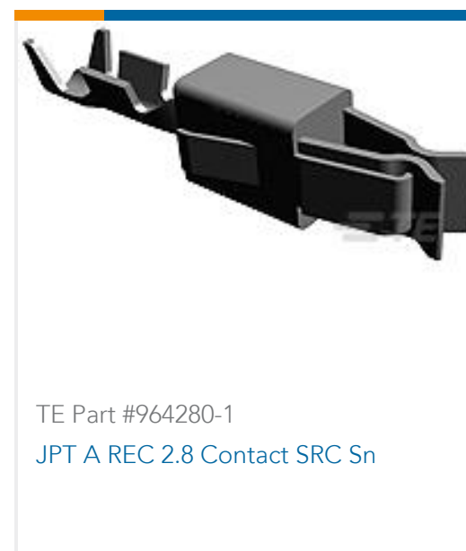
TE Part #964280-1 JPT A REC 2.8 Contact SRC Sn