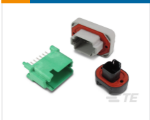
TE Part #DT15-12PB DEUTSCH DT Headers