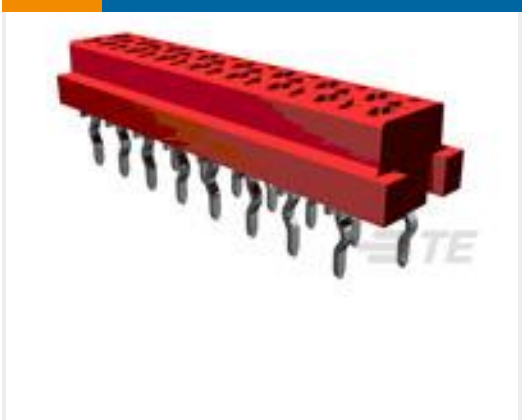
TE Part #1-215079-4 MICRO-MATCH FOB.14P