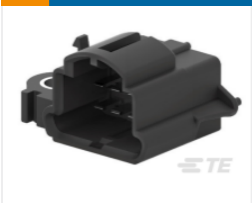
TE Part #1534046-1 Low & Medium Power Header