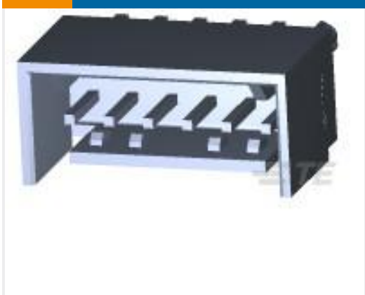
TE Part #2-644486-6 06P MTA100 SHRDED HDR ASSY SN