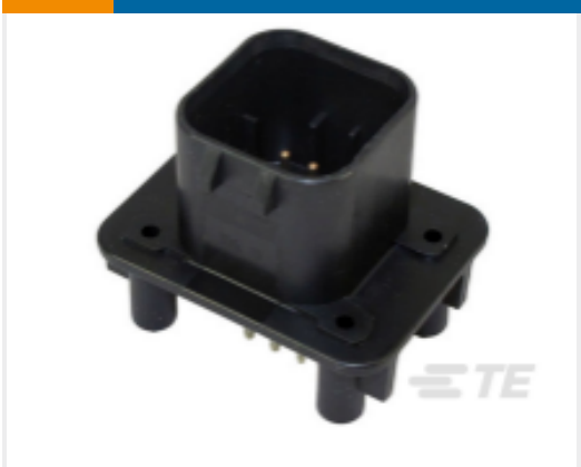
TE Part #1-776275-1 8POS,PIN DIA 1.3,HDR ASSY,180DEG, COD 1