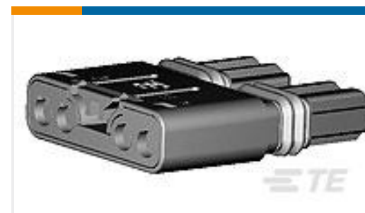
TE Part #2106135-4 Assembly, Free Hanging Plug, SLC, 4 pos