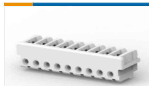
TE Part #6-173977-2 AMP COMMON TERMINATION HOUSINGS