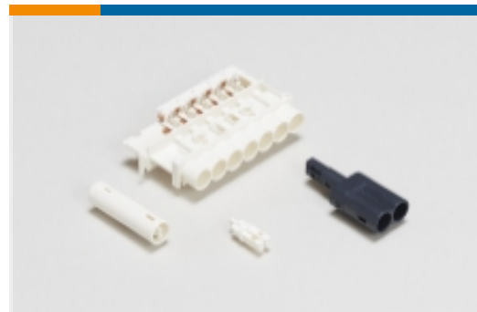
Plug & Socket Lighting Connectors(33)