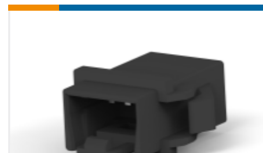
TE Part #2-292215-3 MINI CT SGL RELAY 3P BLACK