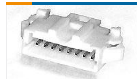
TE Part #292215-4 MINI CT SGL RELAY 4P NAT