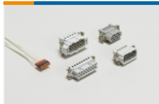
Rectangular Contact Inserts(4)