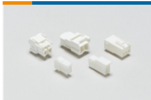
Rectangular Power Connectors(2)