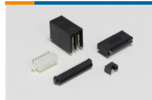
Standard Rectangular Connectors(5)