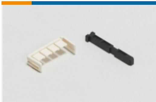
Rectangular Connector Keying Plugs(1)