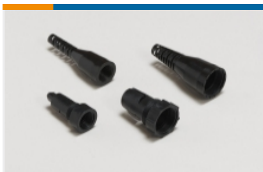
Connector Strain Relief(5)