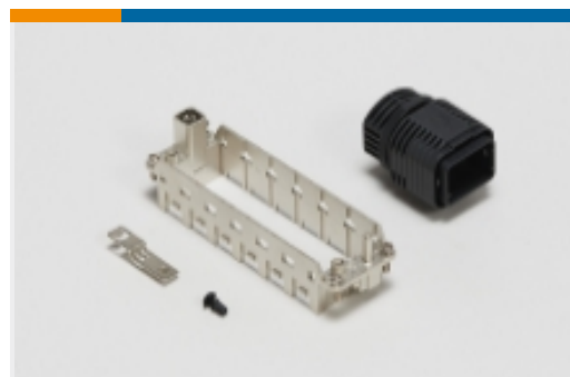
Rectangular Connector Hardware(3)