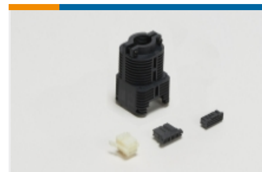
Rectangular Connector Housings(35)