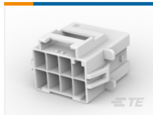
TE Part #2-1971772-2 Standard Temperature Caps | POWER TRIPLE LOCK