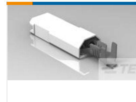
TE Part #521284-1 ULTRA-POD 187 ASSY REC 20-16 AWG BR