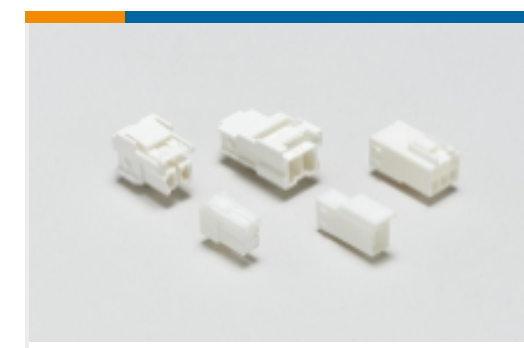
Rectangular Power Connectors(300)