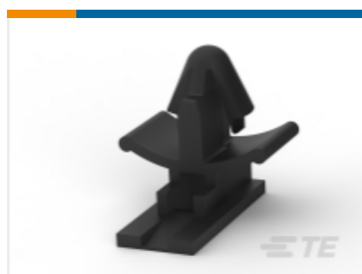
TE Part #936552-2 CLIP HSG FOR 187 CONN BLACK