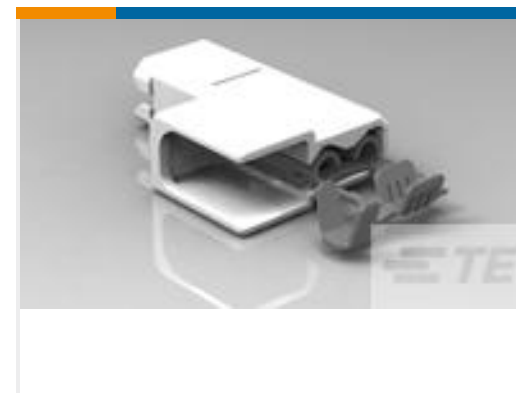
TE Part #521596-2 ULTRA-POD 187 ASSY REC 22-18 AWG TPBR