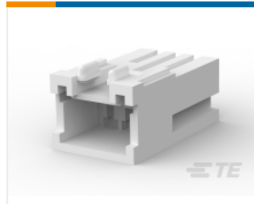
TE Part #316086-1 STD Temp Signal Double Lock Cap