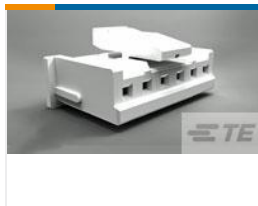
TE Part #1969442-4 EP 2.5 TPA Housing, 4 Pos