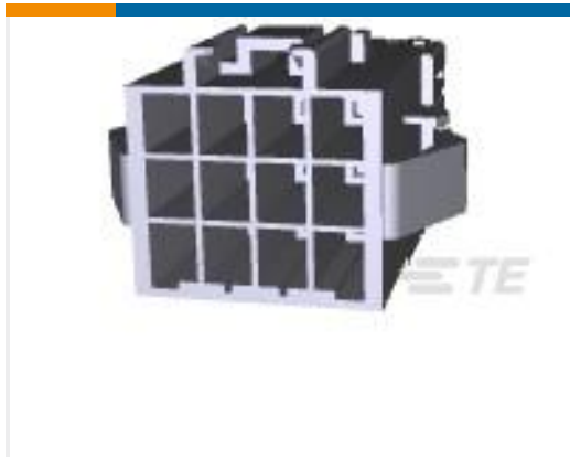
TE Part #177913-1 POWER DBL LOCK CAP HSG P/M 12P