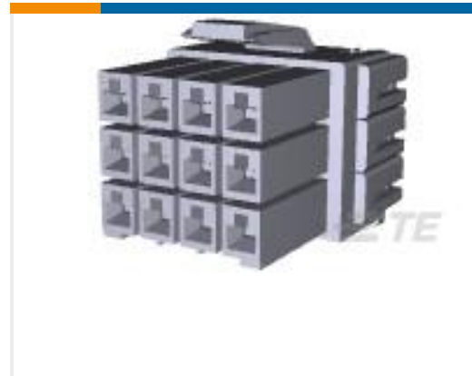
TE Part #177905-1 POWER DBL LOCK PLUG HSG 12P