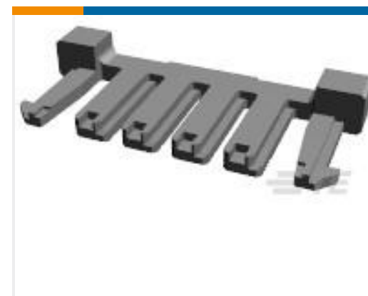
TE Part #917702-1 2.5 SIGNAL D//LOCK D.L.P 6P