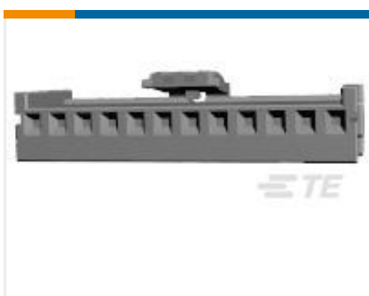
TE Part #917696-1 2.5 SIGNAL D//LOCK PLUG HSG 12P