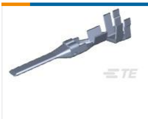
TE Part #177916-1 AMP POWER DBL LOCK TAB (S)