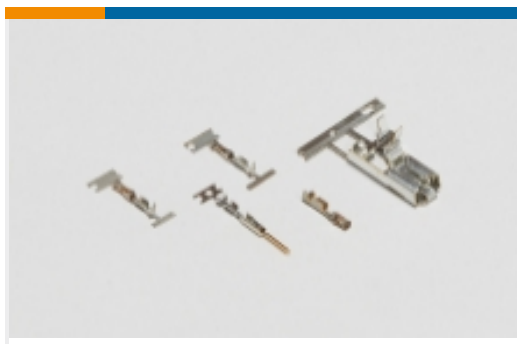
Wire-to-Board Connector Contacts(6)