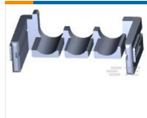
TE Part #177919-1 POWER DBL LOCK PLATE 3P