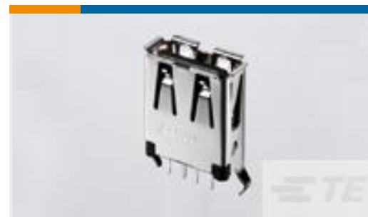
TE Part #1734366-1 Std USB Type A, VT, T/H