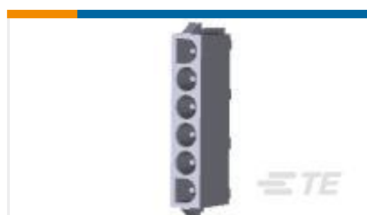
TE Part #643407-1 06P UMNL PIN HDR ASSY POL NATL