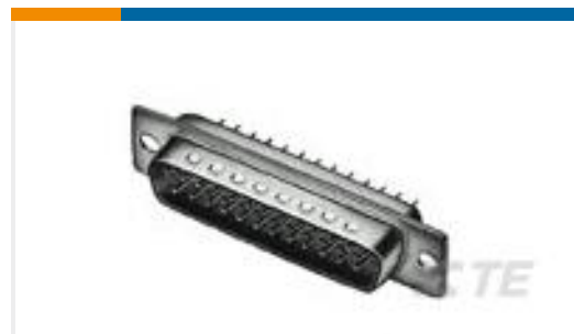
TE Part #7-1393740-8 V42254A2216C209=SUB D STIFTLI