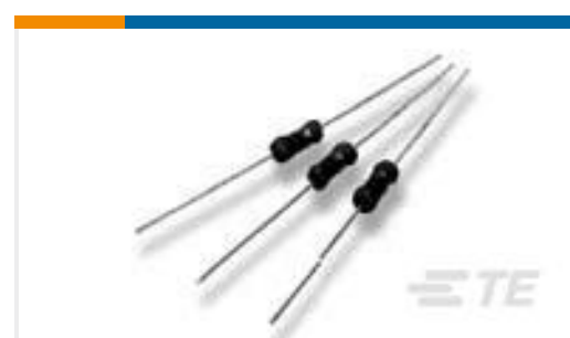
TE Part #1879350-1 RR01 5% R22 AMMO