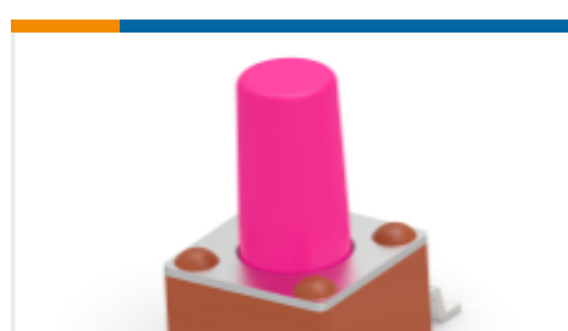
TE Part #2-1977223-6 FSM8JSMASTR=6MM TACT SWITCH, SMT 260gf,