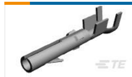
TE Part #163304-2 MATENLOK SOCKET SDW