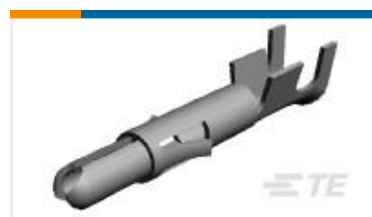
TE Part #350705-2 UMNL SPLIT PIN 20-14 AUBR L/P