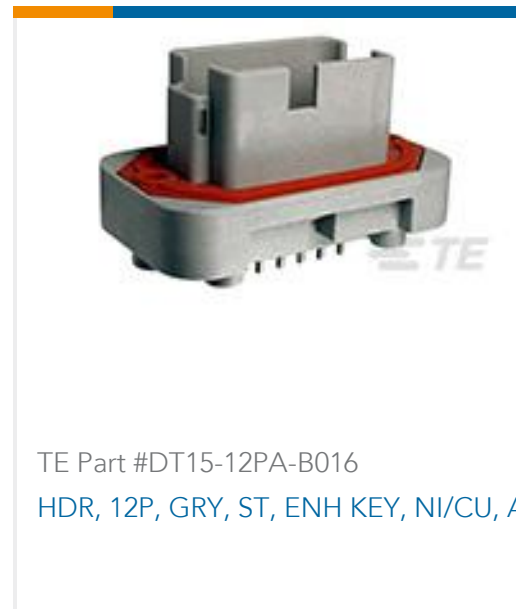
TE Part #DT15-12PA-B016 HDR, 12P, GRY, ST, ENH KEY, NI/CU, A