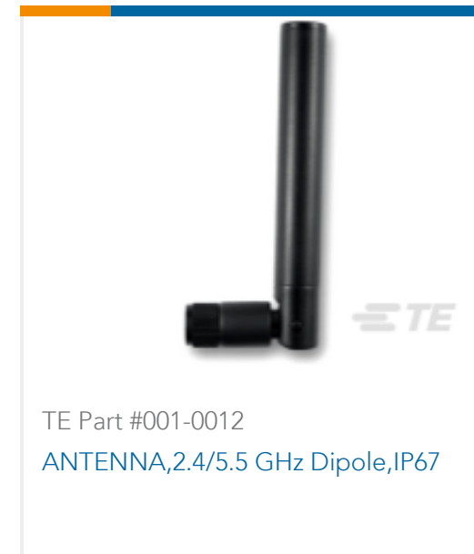
TE Part #001-0012 ANTENNA,2.4/5.5 GHz Dipole,IP67