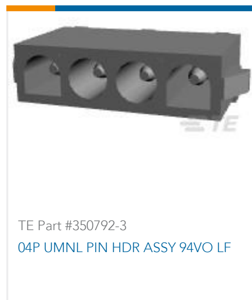
TE Part #350792-3 04P UMNL PIN HDR ASSY 94VO LF