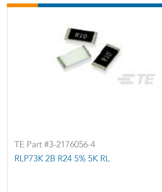
TE Part #3-2176056-4 RLP73K 2B R24 5% 5K RL