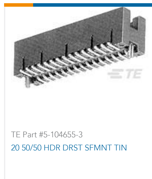
TE Part #5-104655-3 20 50/50 HDR DRST SFMNT TIN