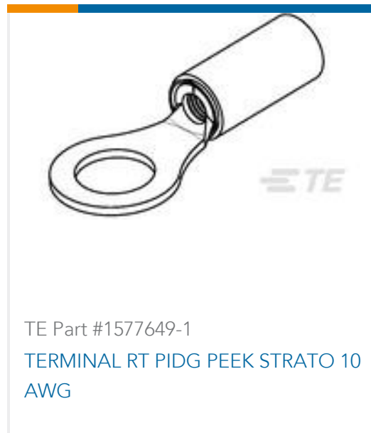
TE Part #1577649-1 TERMINAL RT PIDG PEEK STRATO 10 AWG