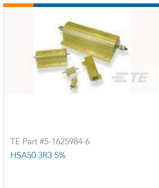
TE Part #5-1625984-6 HSA50 3R3 5%