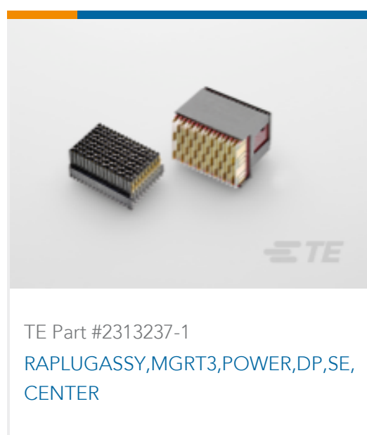
TE Part #2313237-1 RAPLUGASSY,MGRT3,POWER,DP,SE,CENTER