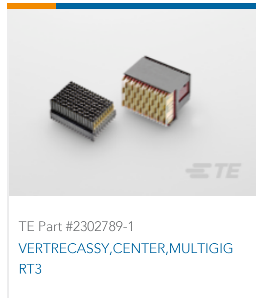
TE Part #2302789-1 VERTRECASSY,CENTER,MULTIGIG RT3