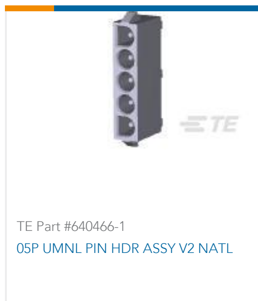
TE Part #640466-1 05P UMNL PIN HDR ASSY V2 NATL