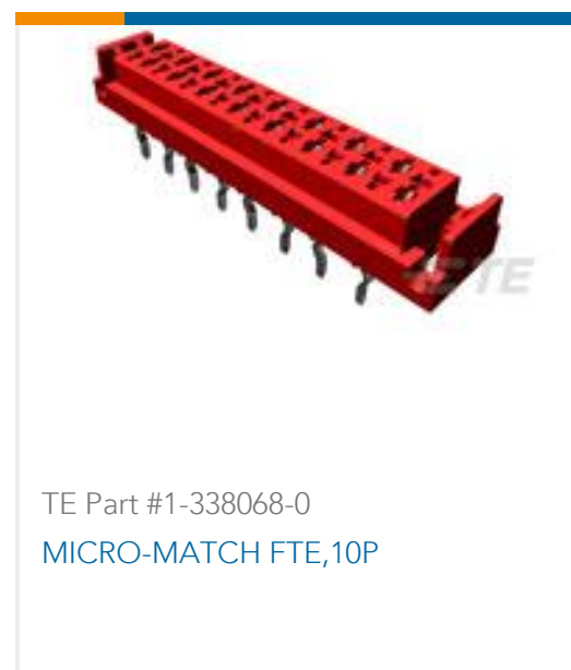
TE Part #1-338068-0 MICRO-MATCH FTE, 10P