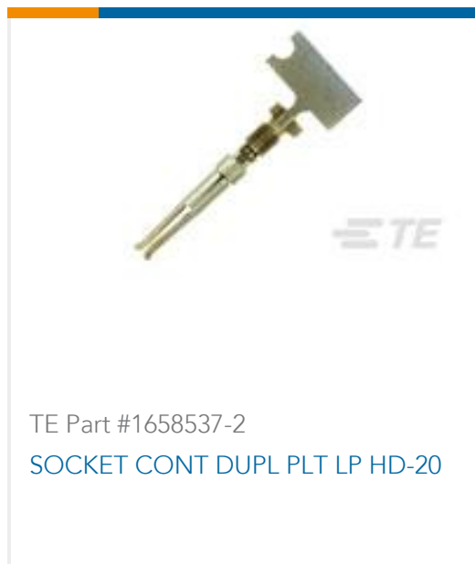
TE Part #1658537-2 SOCKET CONT DUPL PLT LP HD-20