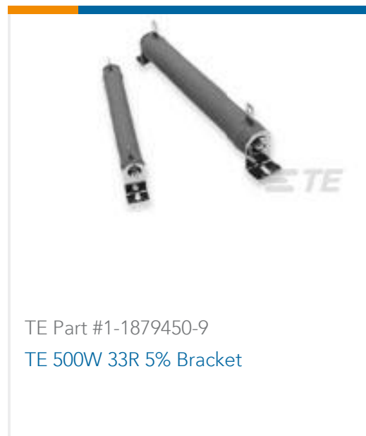
TE Part #1-1879450-9 TE 500W 33R 5% Bracket