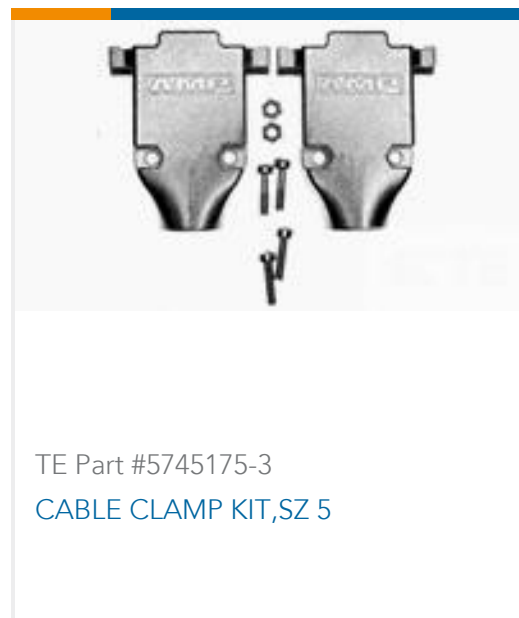
TE Part #5745175-3 CABLE CLAMP KIT,SZ 5