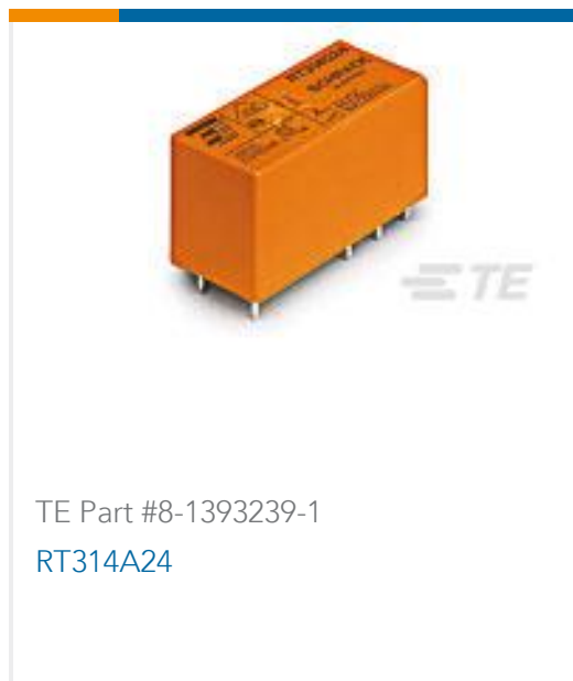
TE Part #8-1393239-1 RT314A24