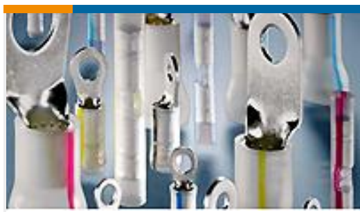
TE Part #53411-1 PIDG PVF2 22-16COM22-18MIL5/16