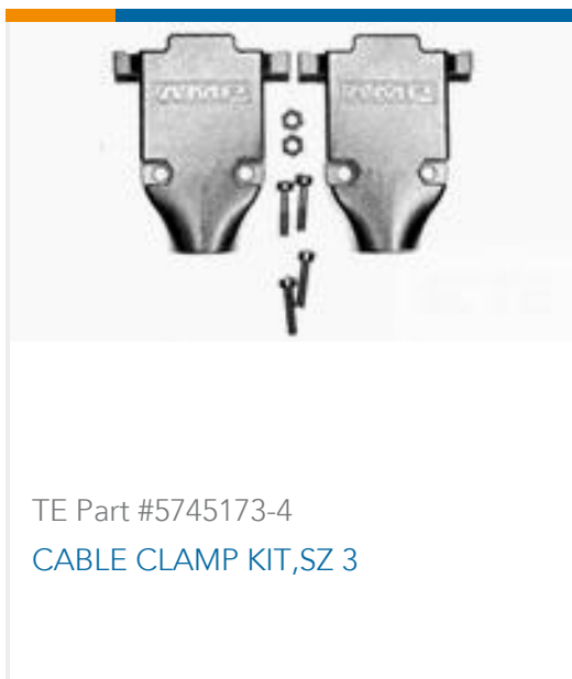
TE Part #5745173-4 CABLE CLAMP KIT,SZ 3