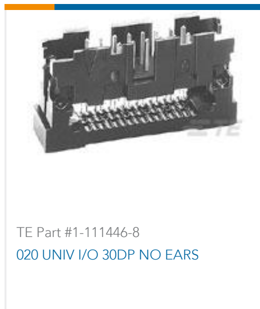
TE Part #1-111446-8 020 UNIV I/O 30DP NO EARS