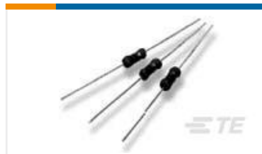
TE Part #7-1625892-2 3W SM M/OX 5% 82K