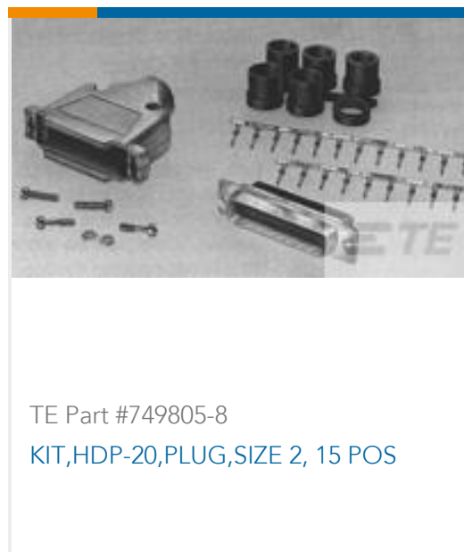
TE Part #749805-8 KIT,HDP-20,PLUG,SIZE 2, 15 POS