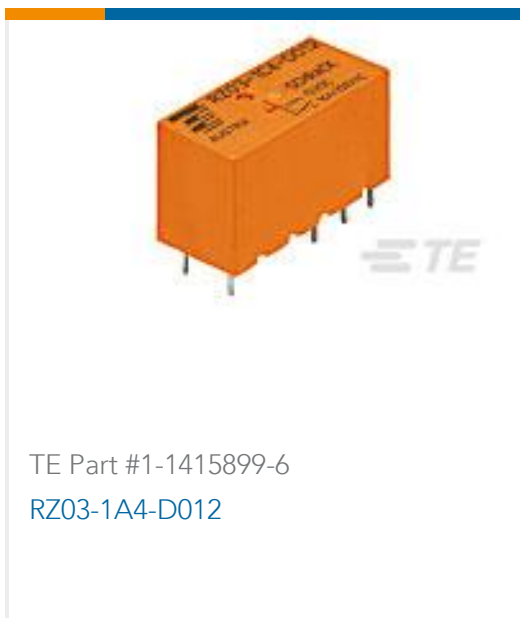
TE Part #1-1415899-6 RZ03-1A4-D012