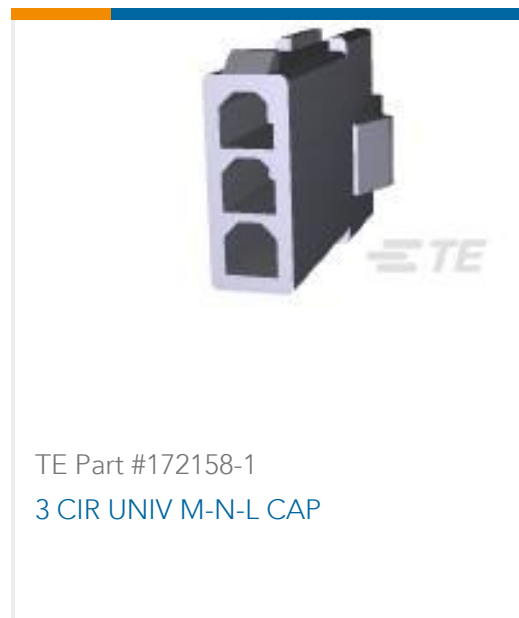
TE Part #172158-1 3 CIR UNIV M-N-L CAP