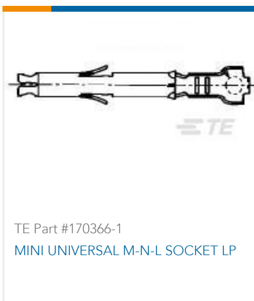
TE Part #170366-1 MINI UNIVERSAL M-N-L SOCKET LP