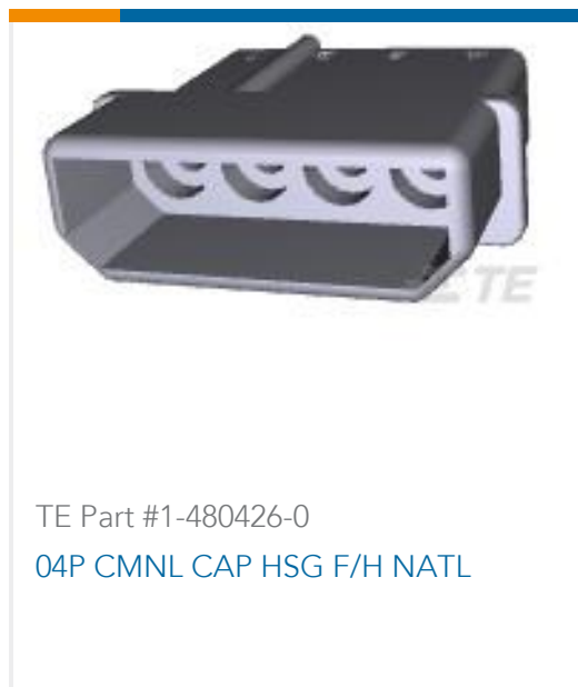
TE Part #1-480426-0 04P CMNL CAP HSG F/H NATL