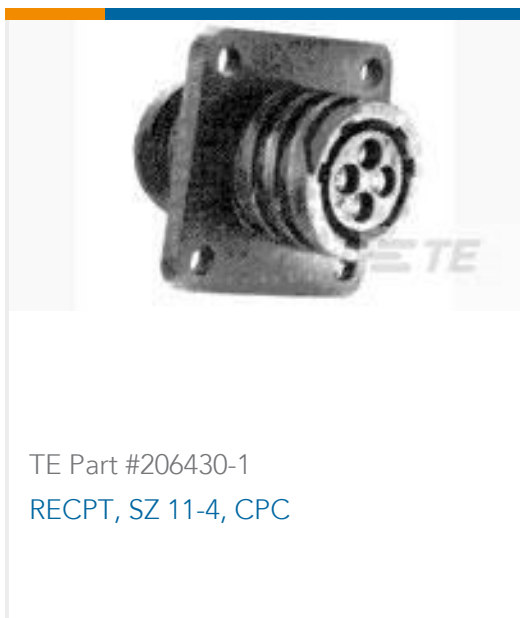
TE Part #206430-1 RECPT, SZ 11-4, CPC