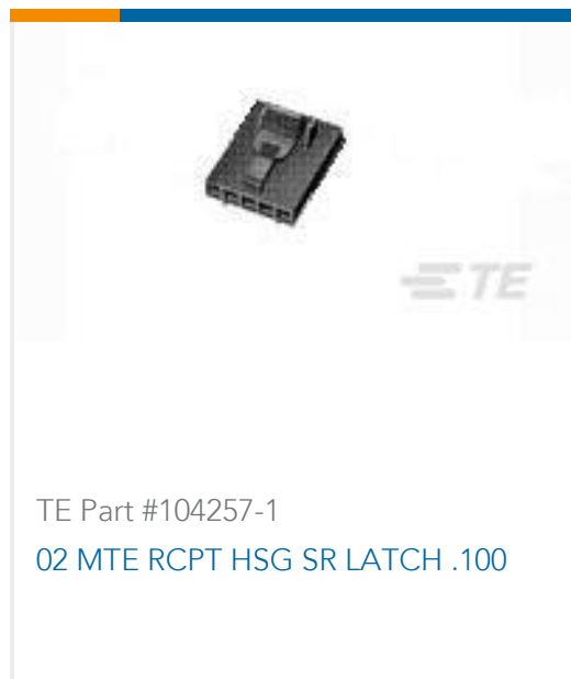
TE Part #104257-1 02 MTE RCPT HSG SR LATCH .100