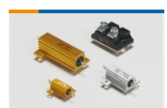
Chassis Mount Resistors(750)