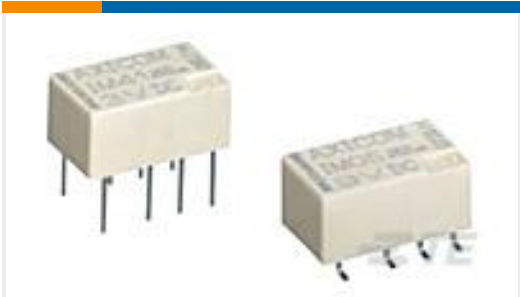
TE Part #1462039-2 IM07CGR=IM RELAY 200mW 24V HDV