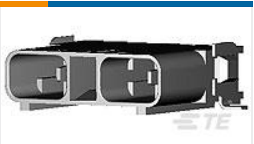
TE Part #2106056-8 Assembly, Right Angle SMT Header, 4-Posi