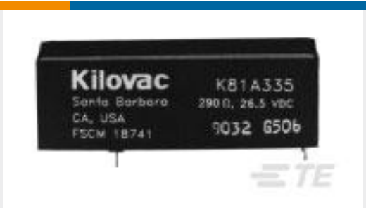
TE Part #2-1618241-8 K81B235=RELAY, VACUUM, SPST-NC