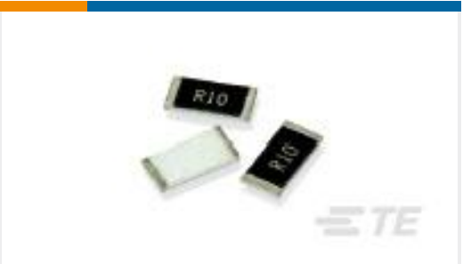
TE Part #4-2176058-2 RLP73K 3A R51 5% 2K RL