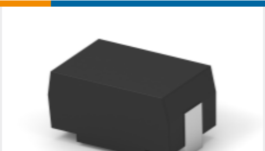
TE Part #1-1879233-3 SMD Power Resistor: 7 Watt, 0.10-500 Ohm