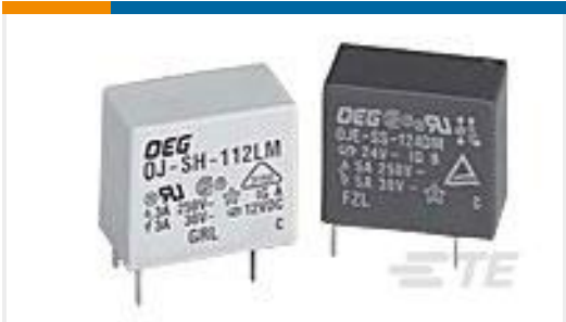
TE Part #6-1419128-4 OJE-SS-124HM,000