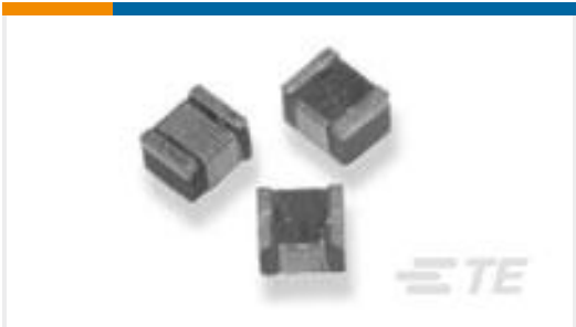
TE Part #5-1624113-5 3650 2A 0.27uH 5% 2K RL