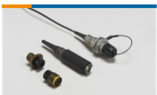
Expanded Beam Fiber Optics(9)