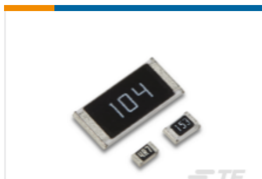
TE Part #3-2176341-1 CRGCQ 0805 3K3 1%