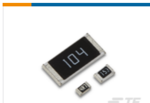
TE Part #2-2176341-1 CRGCQ 0805 470R 1%