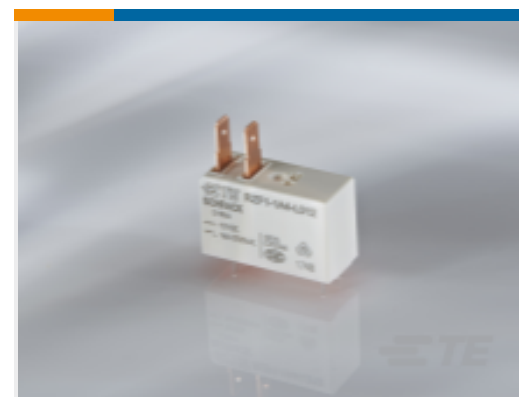
TE Part # 1-1833011-9 RZF1-1A6-L024