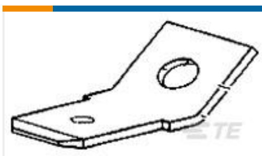
TE Part #42822-4 250 FASTON TAB TPBR