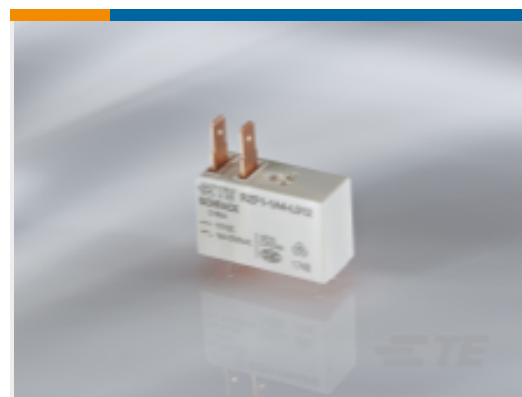
TE Part # 1-1833011-5 RZF1-1A6-L006