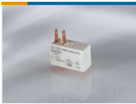
TE Part # 1833011-6 RZF1-1A4-L024