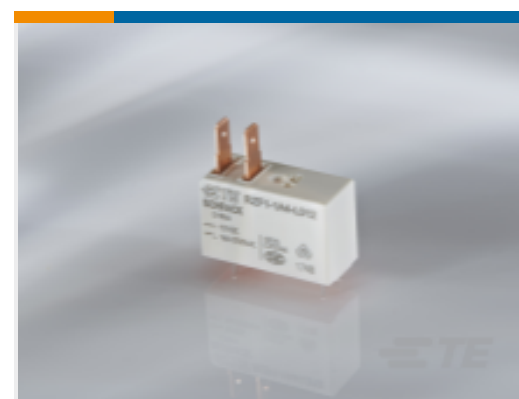
TE Part # 1833011-4 RZF1-1A4-L012