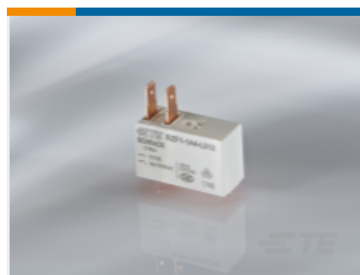
TE Part # 1833011-1 RZF1-1A4-L005