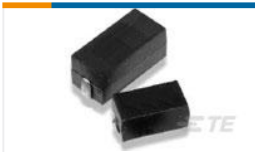
TE Part #1879021-1 SMW3 R10 5%