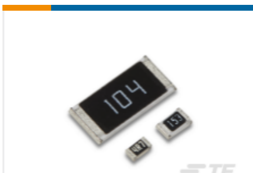
TE Part #3-2176341-8 CRGCQ 0805 12K 1%