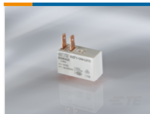
TE Part # 1-1833011-8 RZF1-1A6-L018