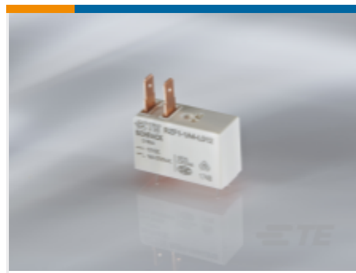
TE Part # 2-1833011-0 RZF1-1A6-L048