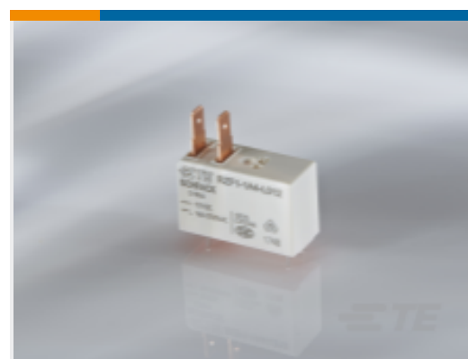
TE Part # 1833011-2 RZF1-1A4-L006