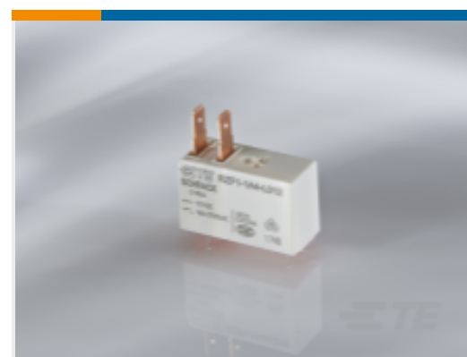
TE Part # 1833011-3 RZF1-1A4-L009