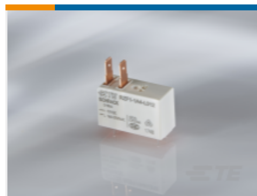
TE Part # 1-1833011-6 RZF1-1A6-L009