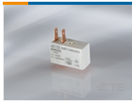
TE Part # 2-1833011-8 RZF1-1A6-L005