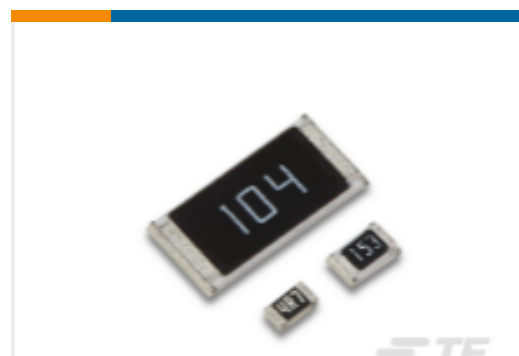
TE Part #2176349-1 CRGCQ 2512 10R 1%