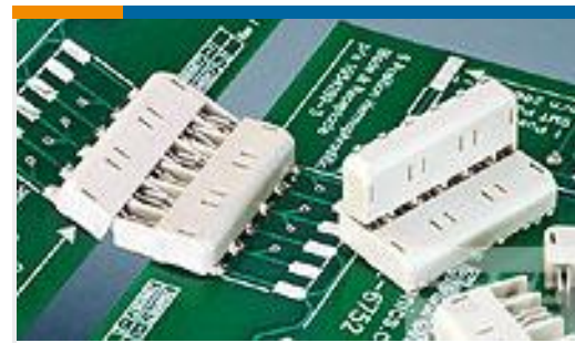
TE Part #1954289-3 Connector,Blade & Recept 6 Pos