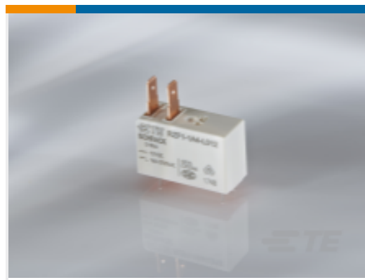
TE Part # 1833011-7 RZF1-1A4-L048