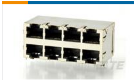
TE Part #5569257-1 STK MJ ASSY,8POS,2X4,SHLD,CAT5