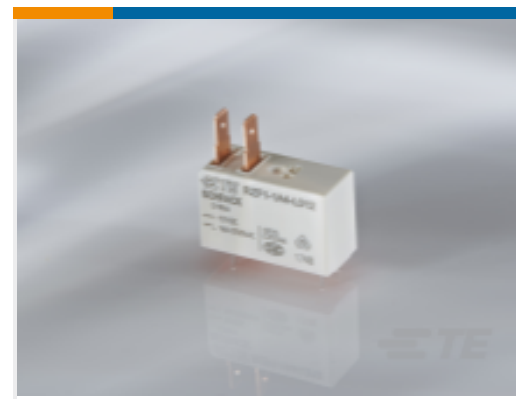
TE Part # 1833011-7 RZF1-1A4-L048