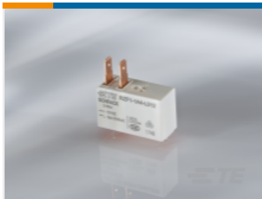
TE Part # 1-1833011-6 RZF1-1A6-L009