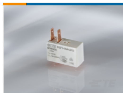
TE Part # 1833011-2 RZF1-1A4-L006