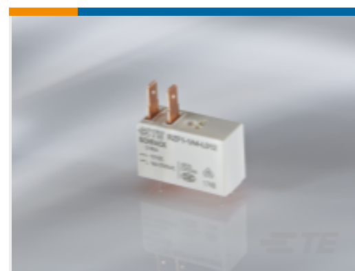
TE Part # 1833011-3 RZF1-1A4-L009