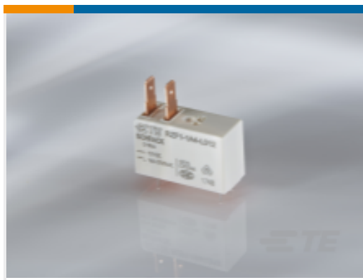
TE Part # 1833011-5 RZF1-1A4-L018