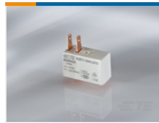
TE Part # 2-1833011-0 RZF1-1A6-L048