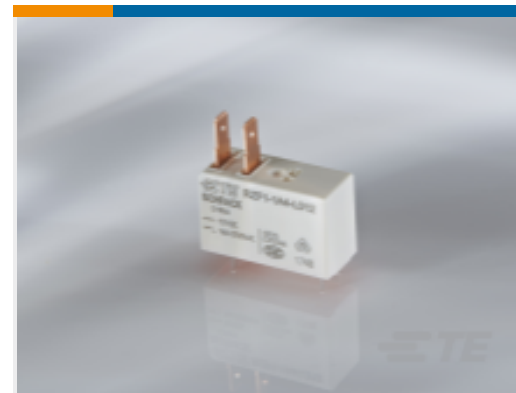
TE Part # 1-1833011-8 RZF1-1A6-L018