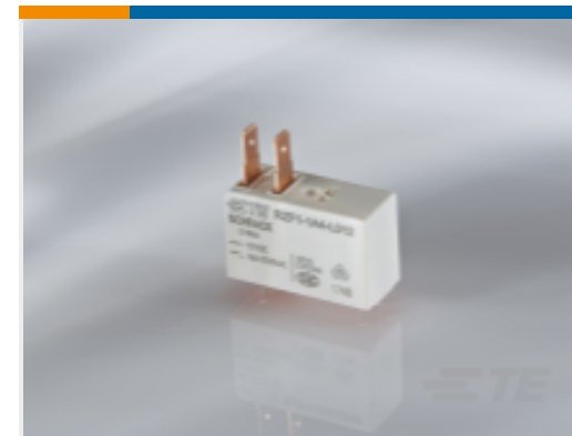
TE Part # 1-1833011-9 RZF1-1A6-L024