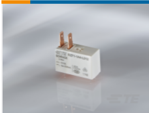
TE Part # 2-1833011-8 RZF1-1A6-L005