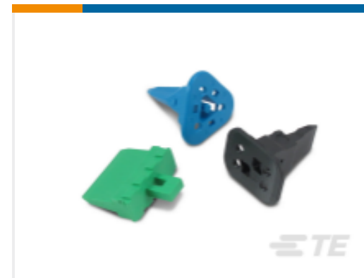
TE Part #W2P Wedgelocks: DEUTSCH DT