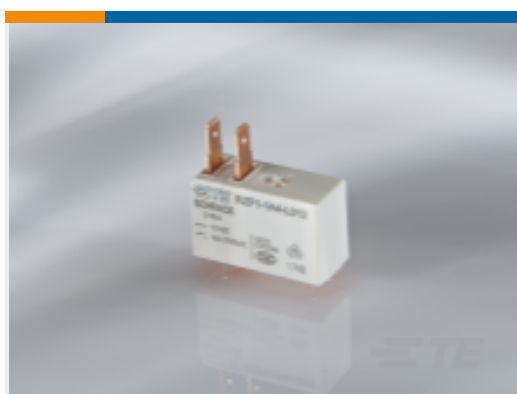
TE Part # 1833011-1 RZF1-1A4-L005