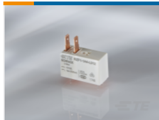
TE Part # 1-1833011-7 RZF1-1A6-L012