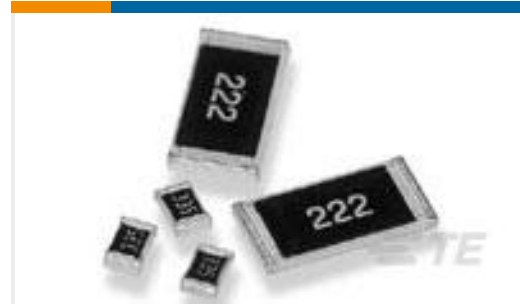
TE Part #4-1879501-3 CRGH2512 5% 56R 2W