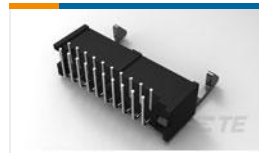
TE Part #2-1761607-6 IDC LOW PRO HDR 16P RA LG LAT