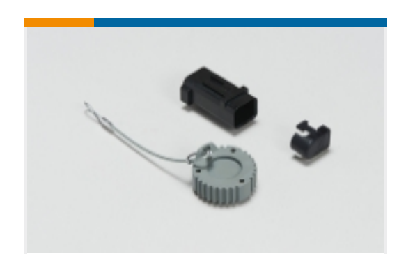
Automotive Connector Caps & Covers (17)