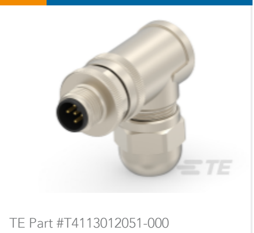
M12 M, 5P GOLD A_CODE RA SHIELDED PG9