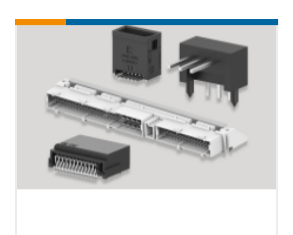
PCB Headers & Receptacles(16)