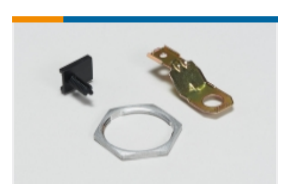
Other Automotive Connector Accessories(15)