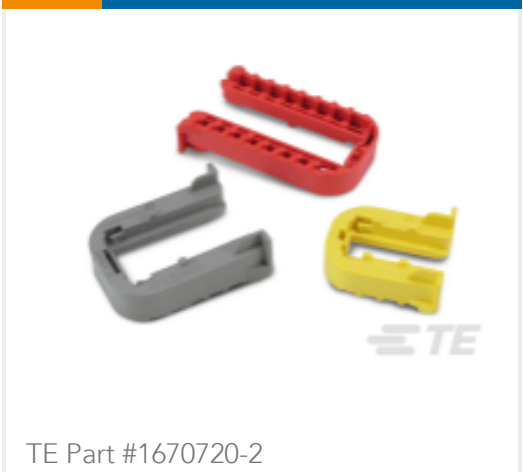
Heavy Duty Sealed Connector Series Fixing Slides