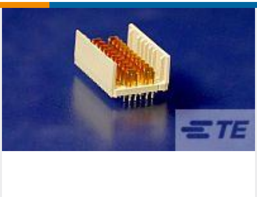
TE Part #6469076-1 HM-ZD 2PR HDR ASSY 1.8MM