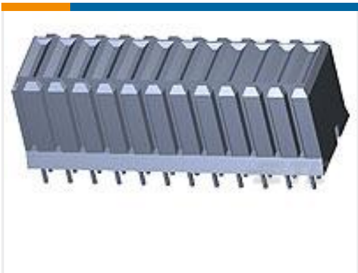
TE Part #120953-1 TE UPM Ver Receptacle 4P HC Power