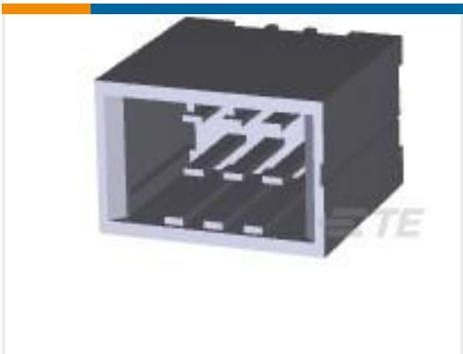
TE Part #178323-2 DYNAMIC D3100D HDR V 6P ASSY AU038