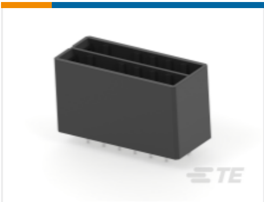
TE Part #1-917338-2 Header Assembly: Wire-to-Board, 15A, gold or tin plated