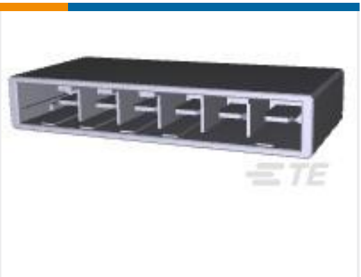
TE Part #6-179960-2 D5 V-HDR ASSY 6P TAIL LENGTH 4