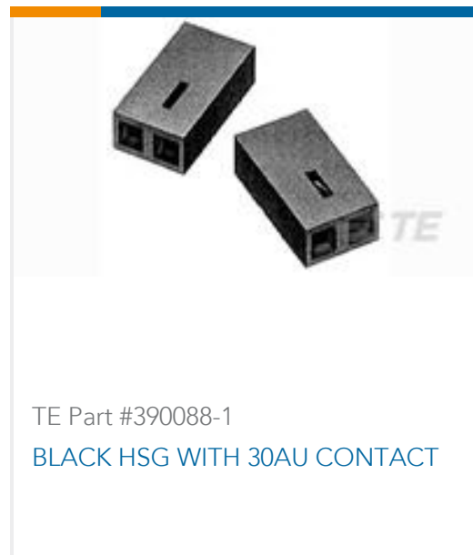
TE Part #390088-1 BLACK HSG WITH 30AU CONTACT