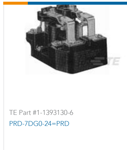
TE Part #1-1393130-6 PRD-7DGO-24=PRD