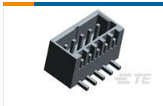
TE Part #5-1775443-4 EMIX CONN., 1.5MM PITCH, HDR, V/T, 4P