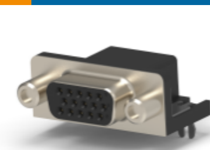
TE Part #2311763-3 AMPL REC, HD22, R/A, 15P, THREADED