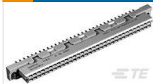
TE Part #7-1393640-2 V42254B2201B200=PC612 FEDERLEI