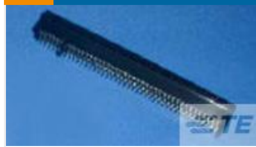
TE Part #5145154-4 STANDARD EDGE .050 SERIES 60 DUAL ASSY