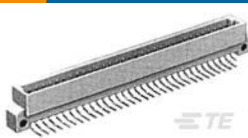
TE Part #5-1393644-6 V42254B1200B200=PC612 MESSERLE