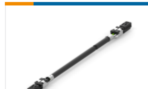
TE Part #1-2362764-0 MATENET,CABLE ASSY,1 GBPS UTP HS