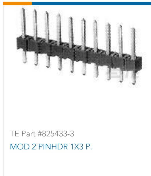
TE Part #825433-3 MOD 2 PINHDR 1X3 P.