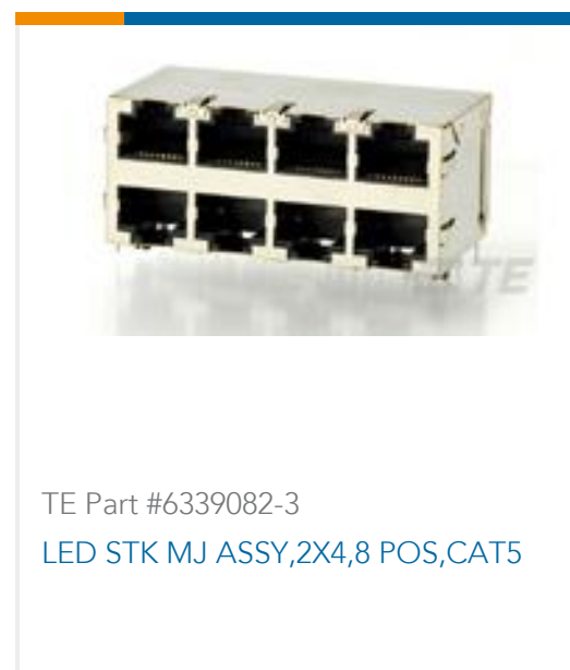
TE Part #6339082-3 LED STK MJ ASSY, 2X4, 8 POS, CAT5