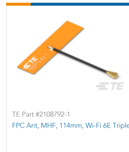
TE Part #2108792-1 FPC Ant, MHF, 114mm, Wi-Fi 6E Triple