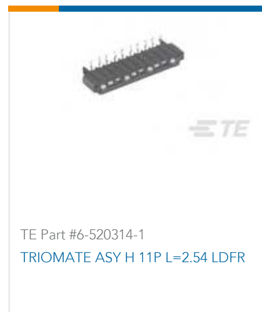
TE Part #6-520314-1 TRIOMATE ASY H 11P L=2.54 LDFR