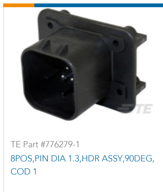
TE Part #776279-1 8POS, PIN DIA 1.3, HDR ASSY, 90DEG, COD 1