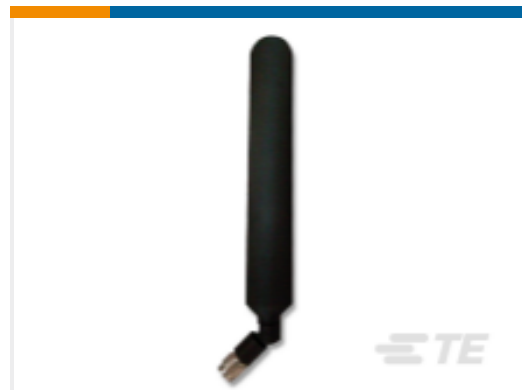
TE Part #DBA6927C1-FSMAM DIPOL,DBA,SMAM,BLK,90D 698-2700Mhz,2dBi,