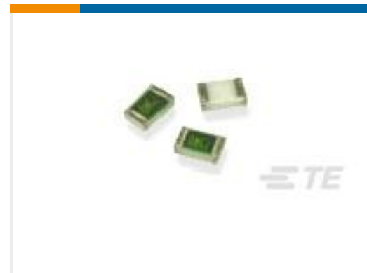
TE Part #2176087-4 RP 1J 0.166W 73R2 0.1% 25PPM 1K RL