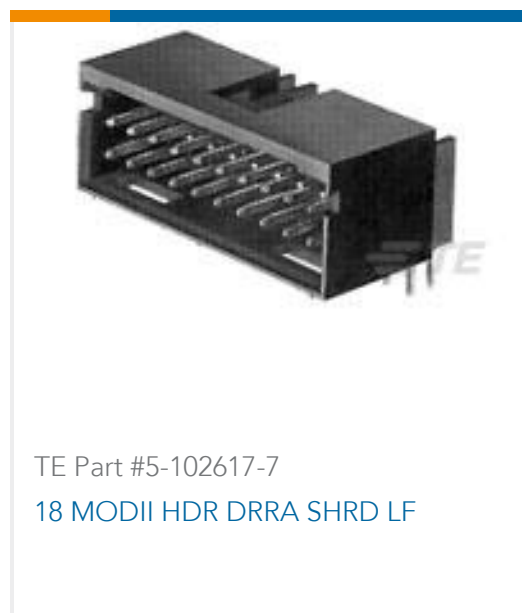
TE Part #5-102617-7 18 MODII HDR DRRA SHRD LF