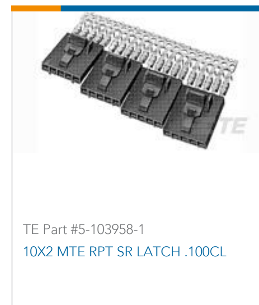
TE Part #5-103958-1 10X2 MTE RPT SR LATCH .100CL