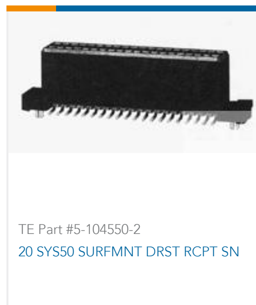
TE Part #5-104550-2 20 SYS50 SURFMNT DRST RCPT SN