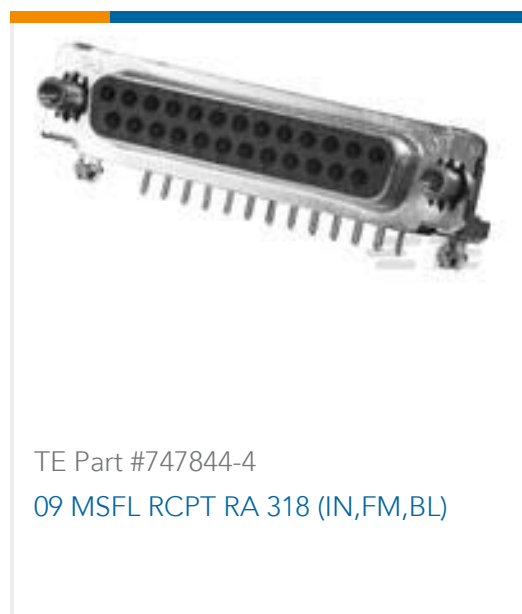
TE Part #747844-4 09 MSFL RCPT RA 318 (IN,FM,BL)