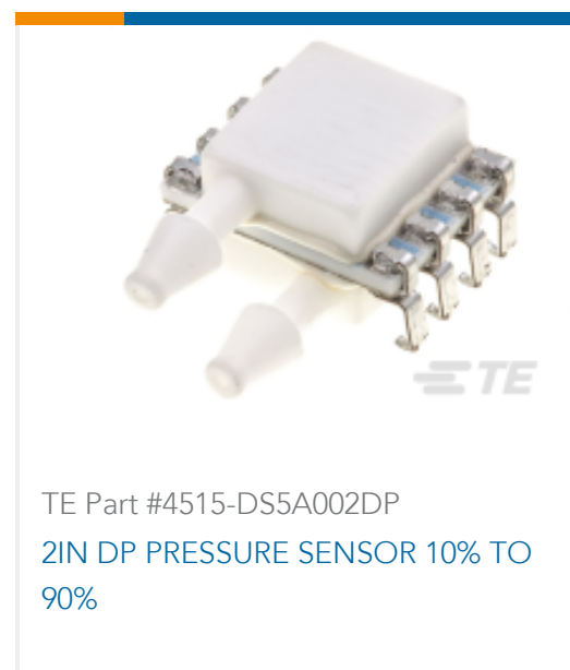
TE Part #4515-DS5A002DP 2IN DP PRESSURE SENSOR 10% TO 90%