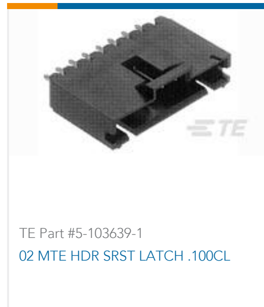
TE Part #5-103639-1 02 MTE HDR SRST LATCH .100CL