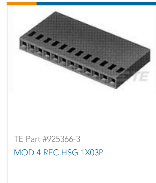
TE Part #925366-3 MOD 4 REC.HSG 1X03P