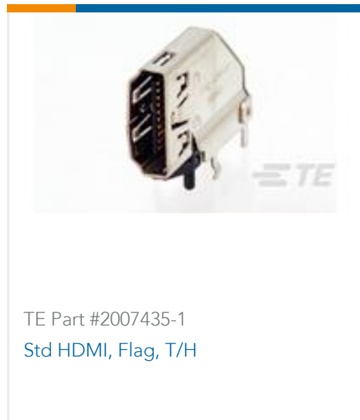
TE Part #2007435-1 Std HDMI, Flag, T/H