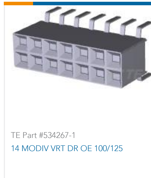
TE Part #534267-1 14 MODIV VRT DR OE 100/125