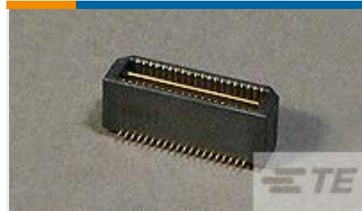
TE Part # 1-1658045-1 MSB0.80PL8ASY28DP,-,F,VCTY