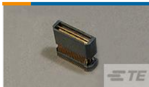
TE Part # 1-1658048-1 MSB0.80PL19ASY28DP,-,F,VCTY