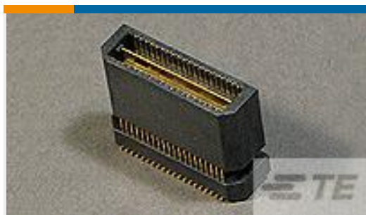
TE Part # 1-1658047-1 MSB0.80PL16ASY28DP,-,F,VCTY