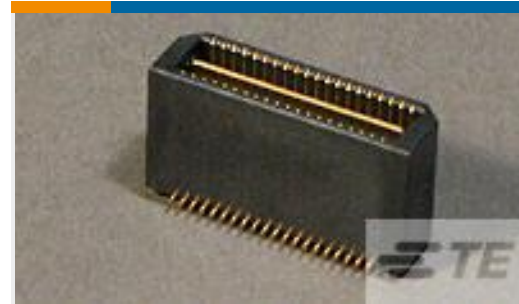
TE Part # 1-1658046-1 MSB0.80PL11ASY28DP,-,F,VCTY