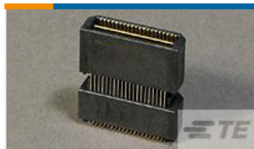
TE Part # 1-1658049-1 MSB0.80PL22ASY28DP,-,F,VCTY