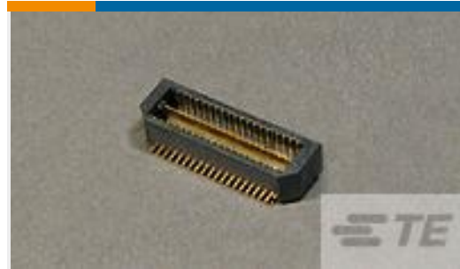
TE Part # 1-1658044-1 MSB0.80PL5ASY28DP,-,F,VCTY