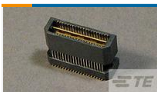
TE Part # 1-1658437-1 MSB0.80PL14ASY28DP,-,F,VCTY