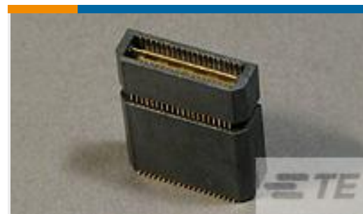
TE Part # 1-1658050-1 MSB0.80PL25ASY28DP,-,F,VCTY