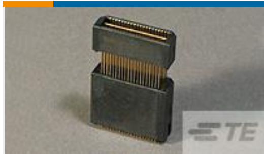
TE Part # 1-1658051-1 MSB0.80PL30ASY28DP,-,F,VCTY