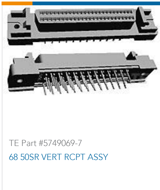
TE Part #5749069-7 68 50SR VERT RCPT ASSY