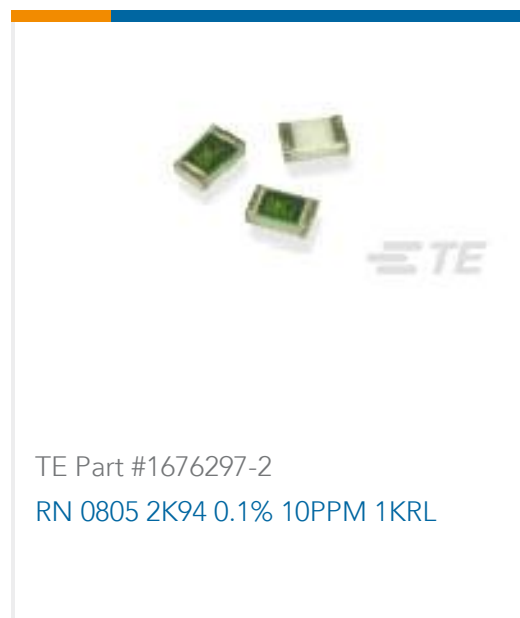
TE Part #1676297-2 RN 0805 2K94 0.1% 10PPM 1KRL