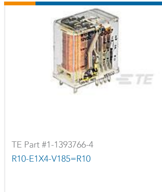
TE Part #1-1393766-4 R10-E1X4-V185=R10