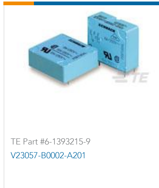
TE Part #6-1393215-9 V23057-B0002-A201