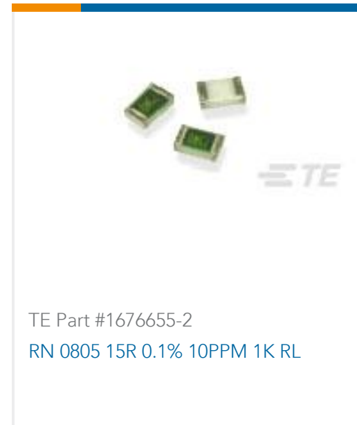
TE Part #1676655-2 RN 0805 15R 0.1% 10PPM 1K RL