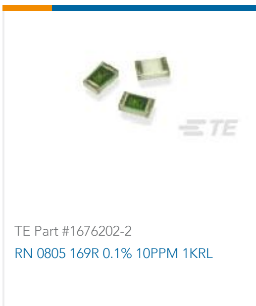
TE Part #1676202-2 RN 0805 169R 0.1% 10PPM 1KRL