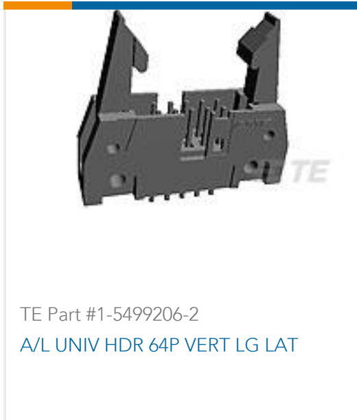
TE Part #1-5499206-2 A/L UNIV HDR 64P VERT LG LAT