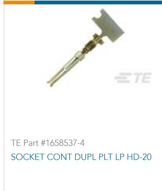
TE Part #1658537-4 SOCKET CONT DUPL PLT LP HD-20