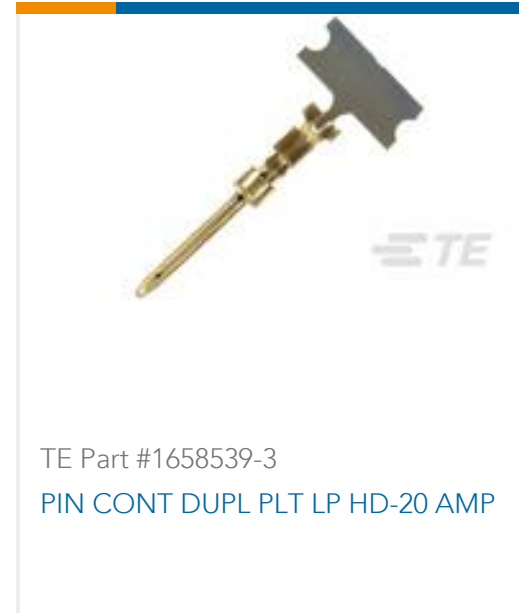
TE Part #1658539-3 PIN CONT DUPL PLT LP HD-20 AMP