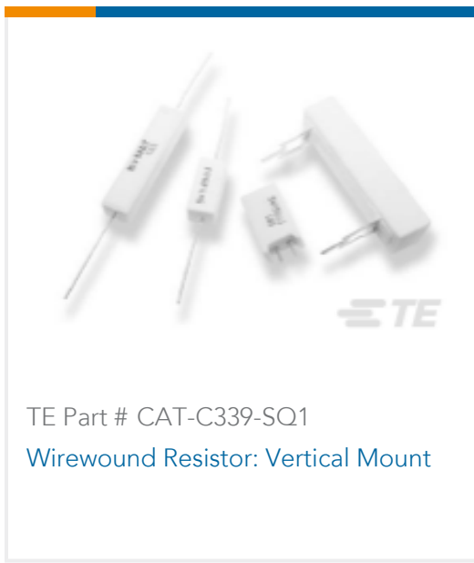
TE Part # CAT-C339-SQ1 Wirewound Resistor: Vertical Mount