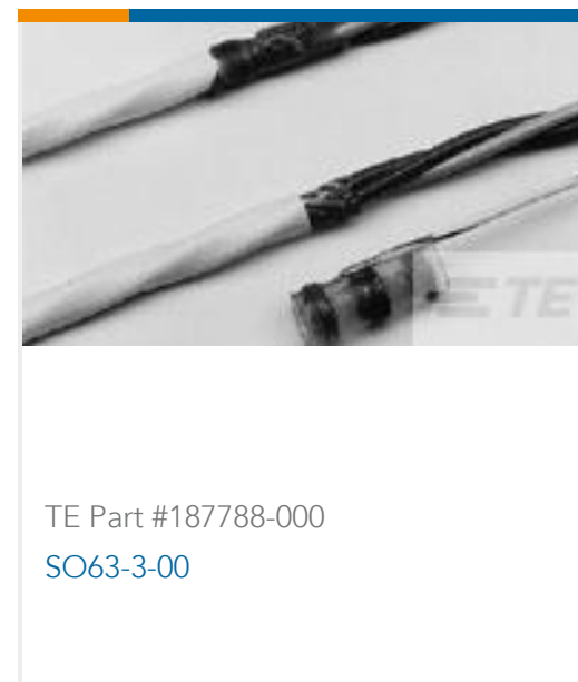
TE Part #187788-000 SO63-3-00