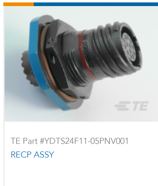
TE Part #YDTS24F11-05PNV001 RECP ASSY