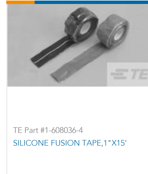
TE Part #1-608036-4 SILICONE FUSION TAPE,1"X15'