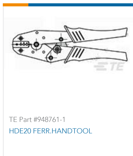
TE Part #948761-1 HDE20 FERR.HANDTOOL