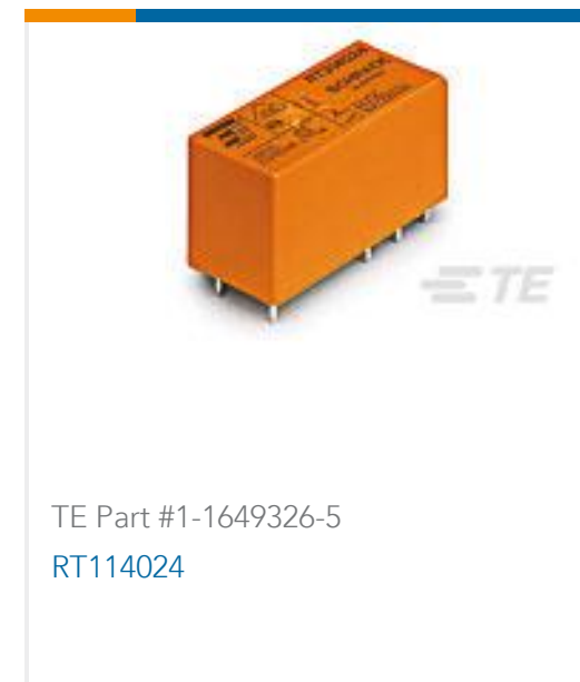
TE Part #1-1649326-5 RT114024