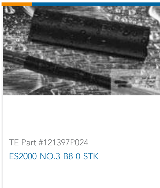
TE Part #121397P024 ES2000-NO.3-B8-0-STK