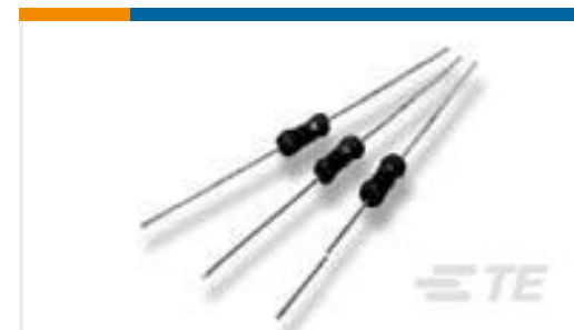
TE Part #1879354-1 RR03 5% R33 AMMO