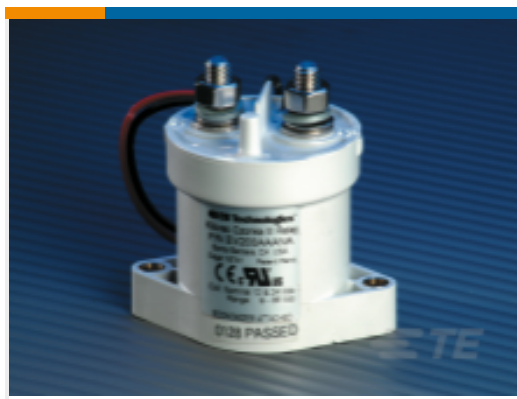
TE Part # 1-1618002-8 EV200HAANA=RELAY, SPST-NO WITH