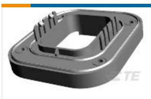
TE Part #1703806-1 ADAPTER,SEALED,ASSY