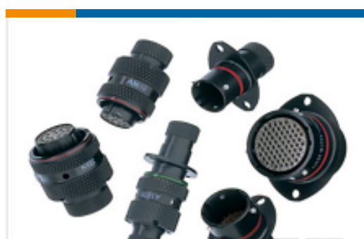
TE Part #AS610-35PD PLUG BOOT TERMIN'N TYPE 6