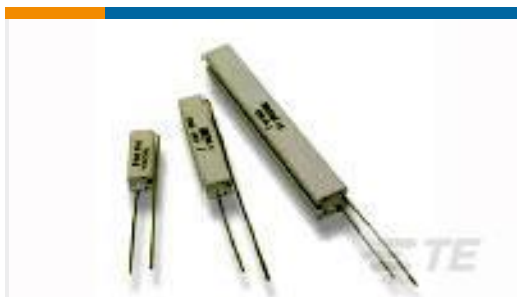
TE Part #2-1623732-4 BCHE 7 W 270R 5%