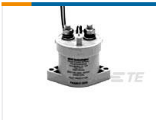
TE Part #1-1618002-2 EV200AJANA=EV200 RELAY, SPST-N