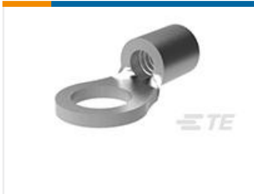
TE Part #34111 SOLIS R 22-16 COMM 22-18 MIL 8