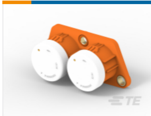
TE Part #2371017-1 2POS,IPT,RING TONGUE HSG ASSY, SLD