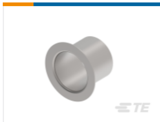
TE Part #2355148-2 SLEEVE,IPT 3P SHIELDING