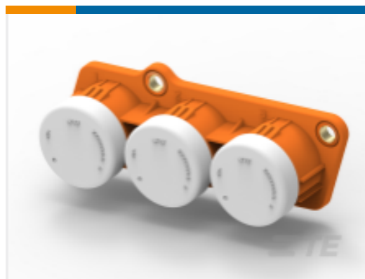
TE Part #2355146-1 3POS,IPT,RING TONGUE HSG ASSY, SLD