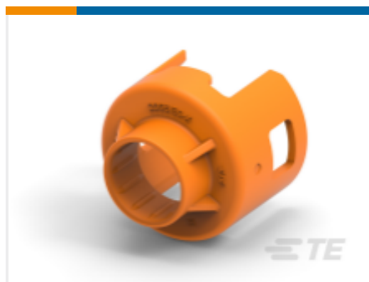
TE Part #2355153-2 COVER,IPT 3P