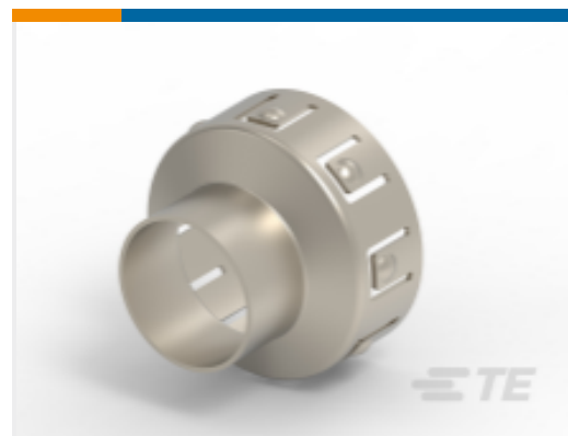
TE Part #2355150-4 SLEEVE,IPT 3P SHIELDING