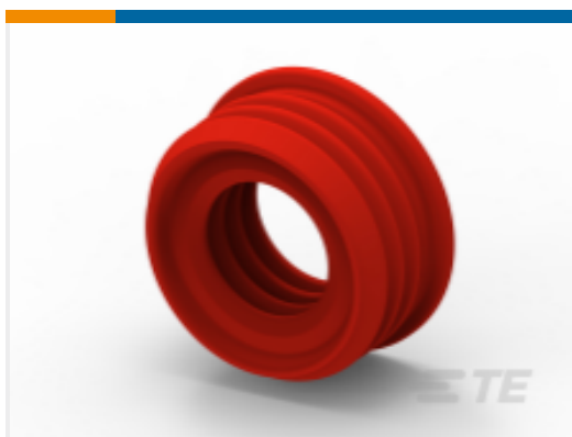
TE Part #2355151-2 SWS,COAX