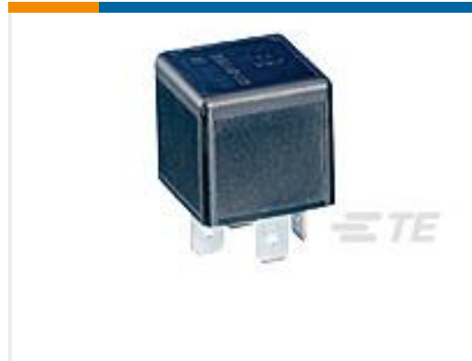
TE Part #1393303-9 V23134B0053C642-EV-CBOX