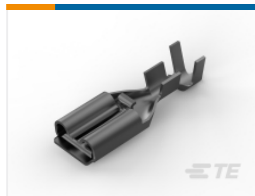
TE Part # 175022-1 250 PL EX REC. 18-14AWG PTBR