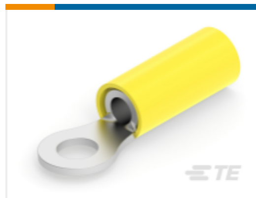
TE Part # 2-36161-3 TERMINAL,PIDG R IR 12 10