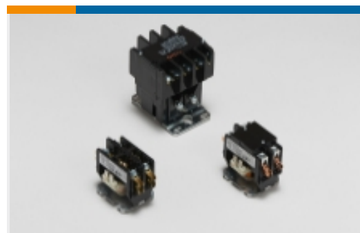
Definite Purpose Contactors(2)