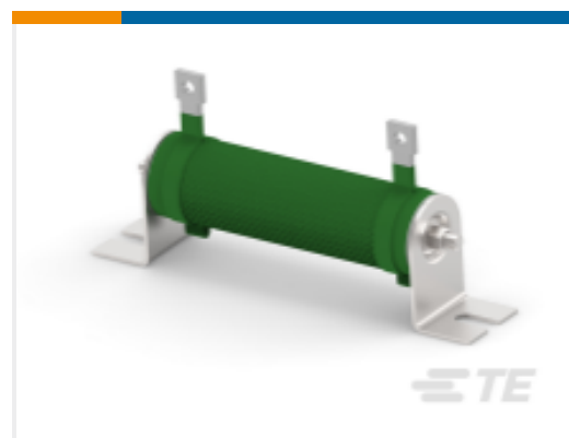
TE Part #1-1879450-7 Wirewound Resistor: Mineral, 2.5 Kw