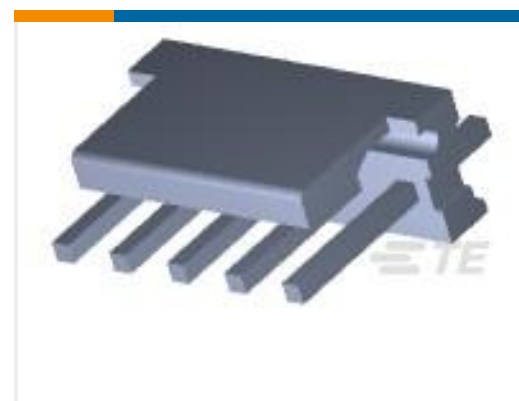
TE Part #3-641119-5 05P MTA156 HDR ASSY FL/ST LF