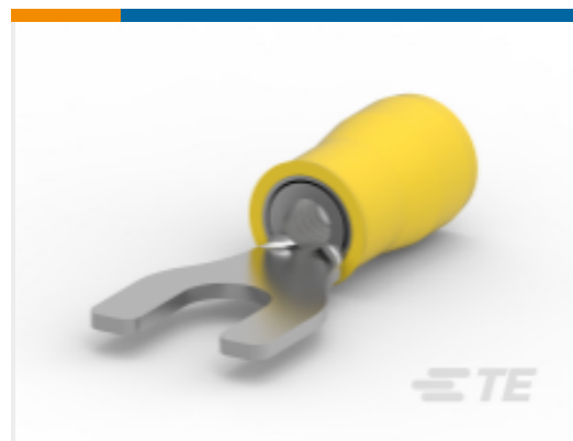
TE Part # 8-32589-2 TERMINAL,PIDG SPD 12-10 10