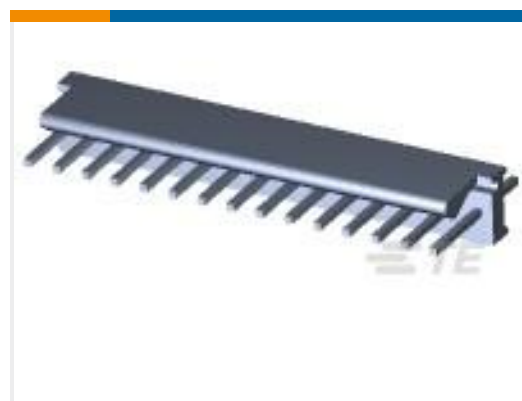
TE Part #4-641126-5 15P MTA100 HDR ASSY FL/STR LF