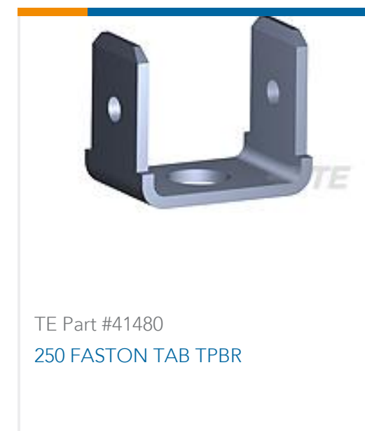
TE Part #41480 250 FASTON TAB TPBR