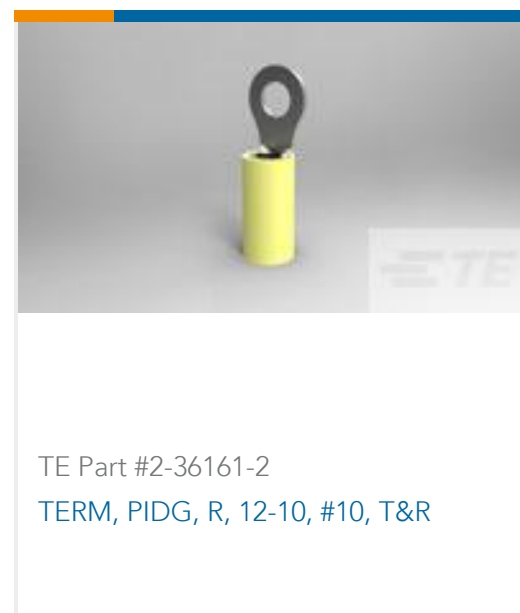
TE Part #2-36161-2 TERM, PIDG, R, 12-10, #10, T&R