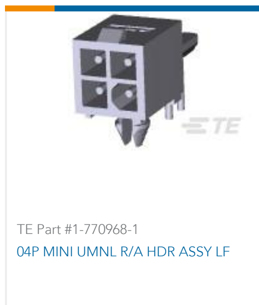
TE Part #1-770968-1 04P MINI UMNL R/A HDR ASSY LF