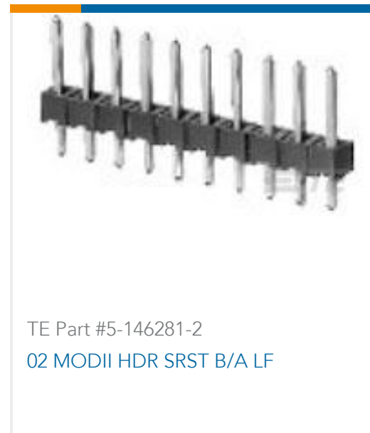
TE Part #5-146281-2 02 MODII HDR SRST B/A LF