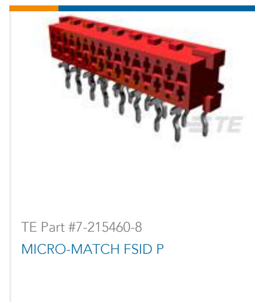
TE Part #7-215460-8 MICRO-MATCH FSID P