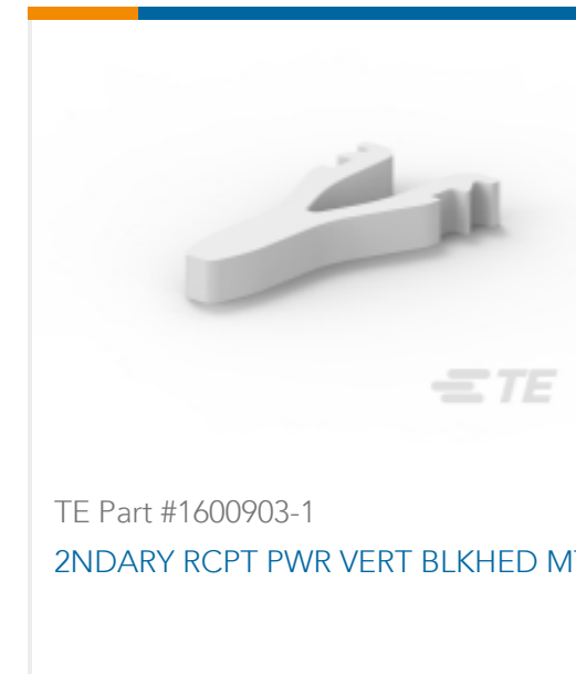
TE Part #1600903-1 2NDARY RCPT PWR VERT BLKHED MT