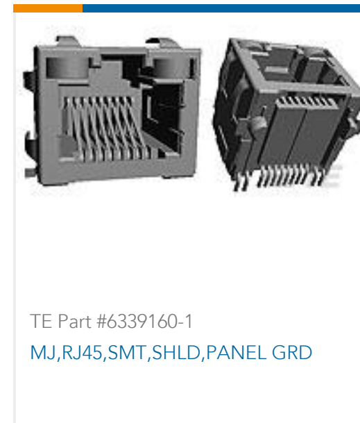
TE Part #6339160-1 MJ,RJ45,SMT,SHLD,PANEL GRD