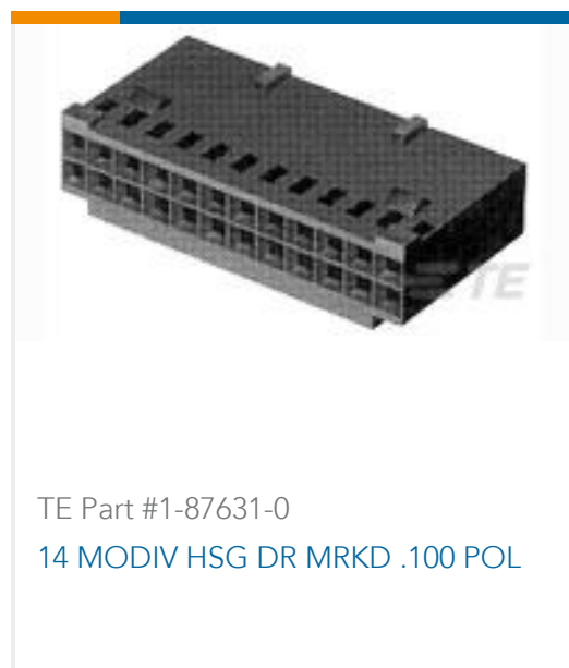
TE Part #1-87631-0 14 MODIV HSG DR MRKD .100 POL