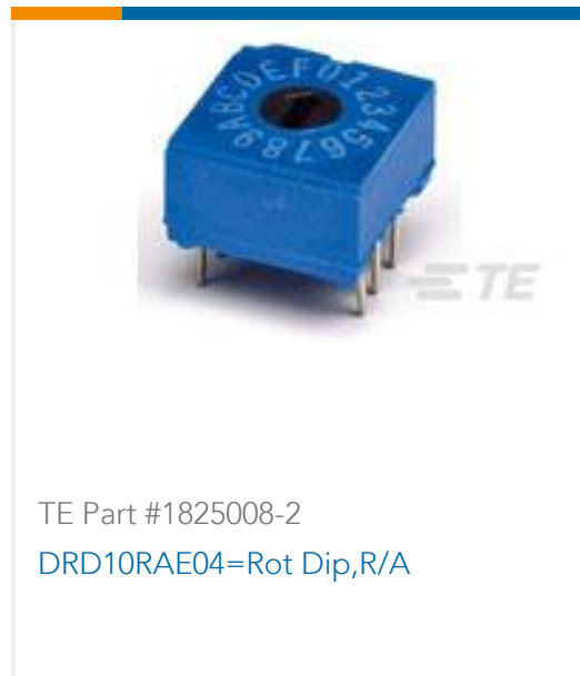
TE Part #1825008-2 DRD10RAE04=Rot Dip,R/A