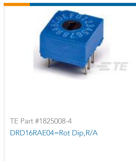
TE Part #1825008-4 DRD16RAE04=Rot Dip,R/A