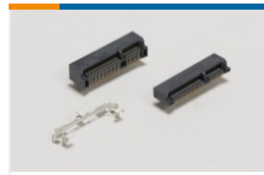
Mini PCI Express & mSATA(1)