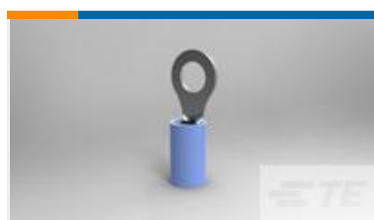
TE Part #2-31903-2 TERMINAL,PIDG R 16-14 10