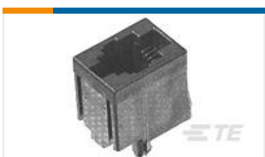
TE Part #5520258-3 M/JTOP6P/6CPNL STOPSTRAY P