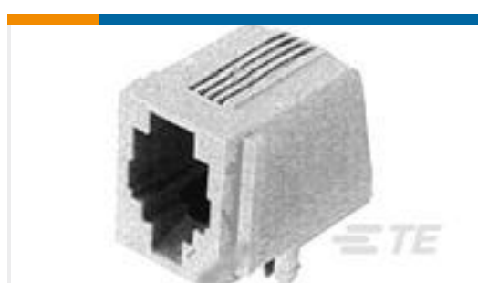
TE Part #5520470-3 MJ,R/A,6P/6C,TRAY PACK