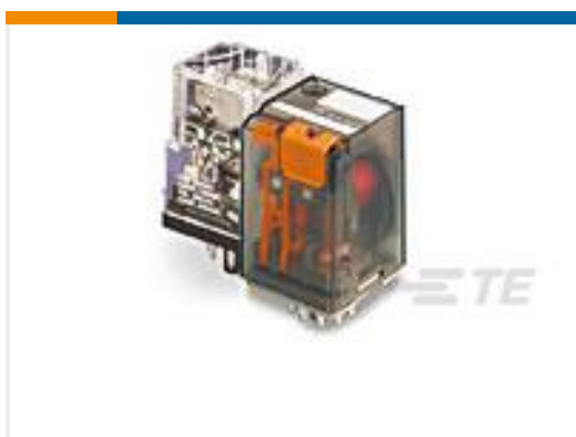
TE Part #9-1393104-0 KRPA-14DN-24=KRPA