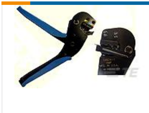
TE Part #59824-1 TETRA-CRIMP PIDG PG FASTON 22-10 ASSY