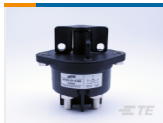
TE Part #K1121749 Battery Disconnecter 35-524-231-S-900