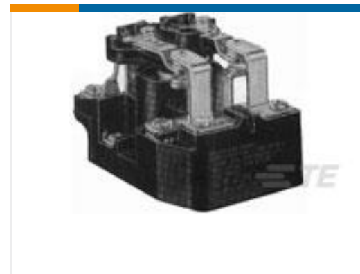
TE Part #1393127-9 PRD-11AG0-120=PRD