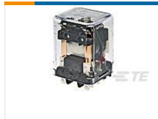
TE Part #8-1393113-7 KUEP-11D15-24=KU-