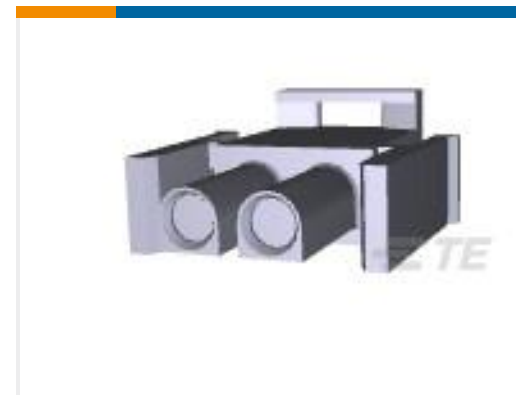
TE Part #1-350777-9 02P UMNL V0 PLUG HSG BLACK