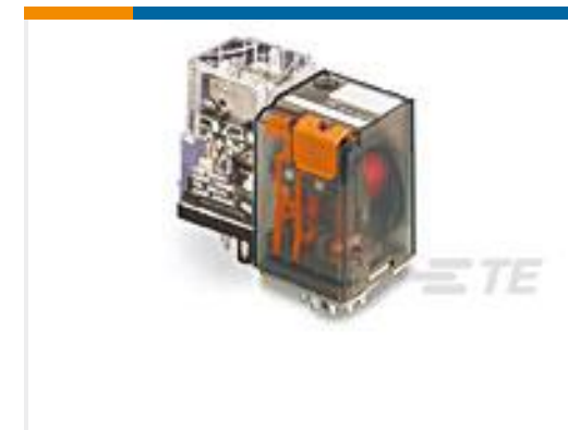
TE Part #7-1393104-4 KRPA-14AN-24=KRPA