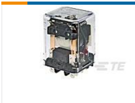
TE Part #8-1393113-6 KUEP-11D15-12=KU