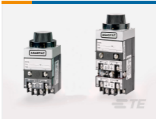
TE Part # 2-1423159-6 7012PD=RLY,STD,ON,2P,125VDC,50