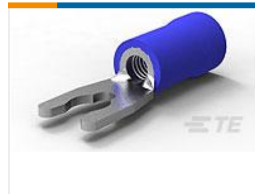
TE Part #52955 TERMINAL,PG SPR SPD 16-14 6