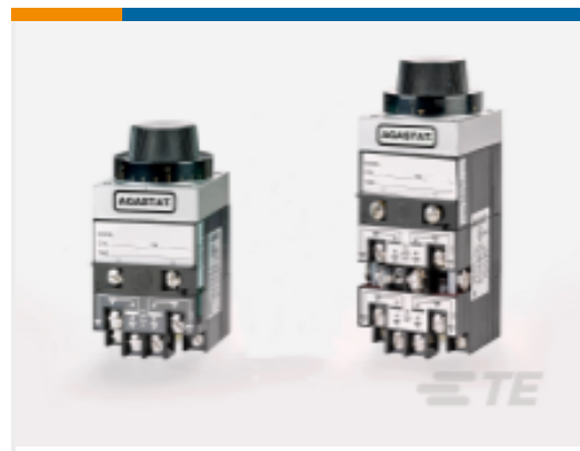
TE Part # 1755074-3 7012CH=RLY,STD,ON,2P,480VAC,30