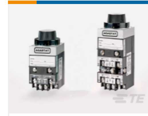
TE Part # 1-1423164-2 7022OF=RLY,STD,OFF,2P,24VDC,1- 15SEC