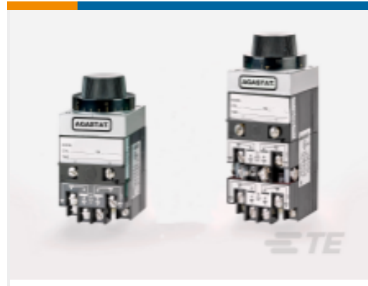
TE Part # 4-1423161-3 7014WCIM=RLY,STD,ON,4P,96V,20S,I, M