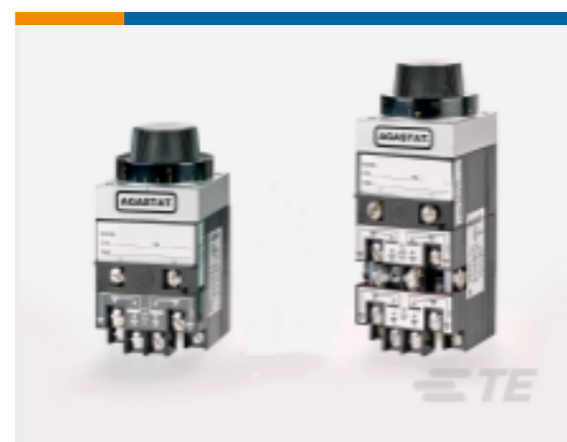
TE Part # 4-1423164-9 7022SJ=RLY, STD, OFF, 250 VDC