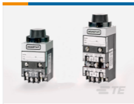
TE Part # 8-1437460-8 7032BBB=RLY,STD,DBH,2P,240VAC,