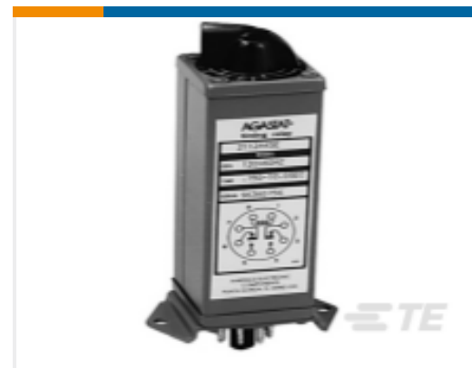
TE Part # 3-1423152-0 2112D4NJ=RLY,MINI,ON,2P,28VDC, 180SEC