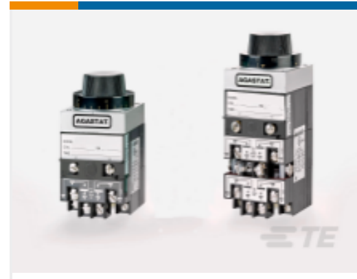
TE Part # 2-1423164-3 7022PDMS=RLY,STD,OFF,2P,125VDC