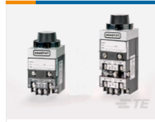
TE Part # 1-1423158-0 7012L8CN=RLY,NAV,ON,2P,115VAC, 15SEC