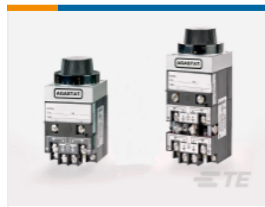
TE Part # 5-1472969-7 7022RCA2I2T=RLY,STD,OFF,2P, 60VDC,15S,I2T