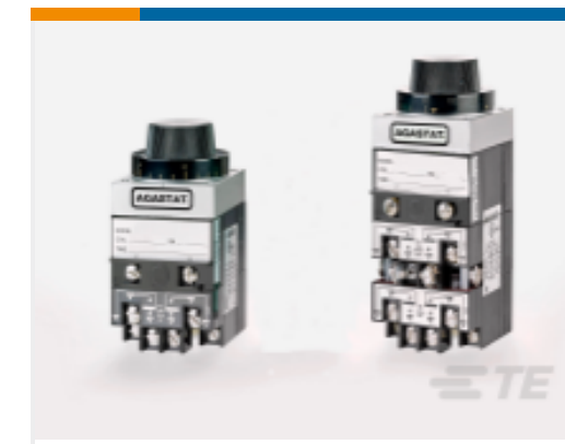
TE Part # 7-1423159-5 7012SJSX=RLY,STD,ON,2P,250VDC