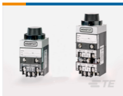
TE Part # 2-1423164-7 7022PF=RLY,STD,OFF,2P,125VDC,1