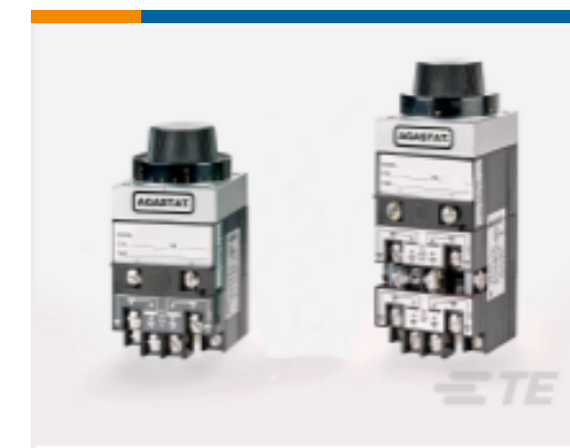
TE Part # 4-1423157-9 7012BFX=RLY,STD,ON,2P,240VAC,