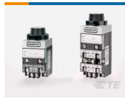
TE Part # 1-1437456-3 7022OBT=RLY,STD,OFF,2P,24VDC,5