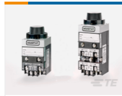
TE Part # 6-1755074-9 7012JB=RLY,STD,ON,2P,208V,5S