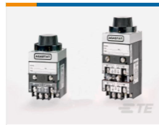
TE Part # 6-1423157-1 7012CA=RLY,STD,ON,2P,480VAC,1