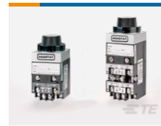
TE Part # 2-1755142-6 7022WDS=RLY,STD,2P,OFF,96V,50S,S