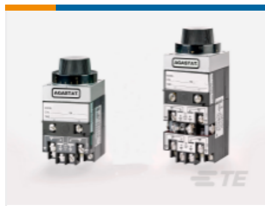
TE Part # 3-1423161-6 7014PBLL=RLY,STD,ON,4P,125V,7S,LL OPT