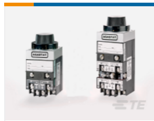
TE Part # 9-1423159-1 7012SEL =RLY,STD,ON,2P,250VDC,