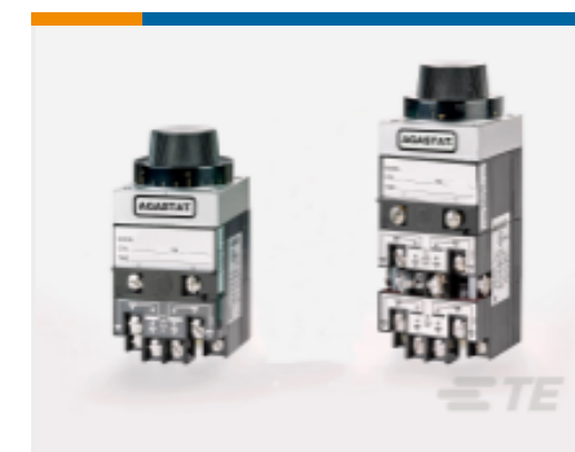
TE Part # 8-1437439-2 7012AALL=RLY,STD,ON,2P,120VAC