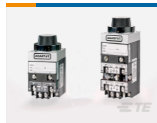
TE Part # 8-1423162-1 7022L27C=RLY,STD,OFF,2P,208- 240VAC,15SEC