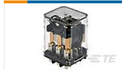
TE Part #4-1393117-3 KUP-11D15-110=KU