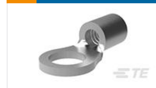
TE Part #35135 TERMINAL,SOLIS R 12-10 1/2