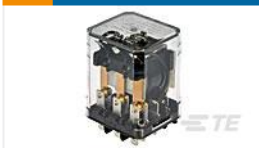
TE Part #4-1393117-2 KUP-11D11-24=KU