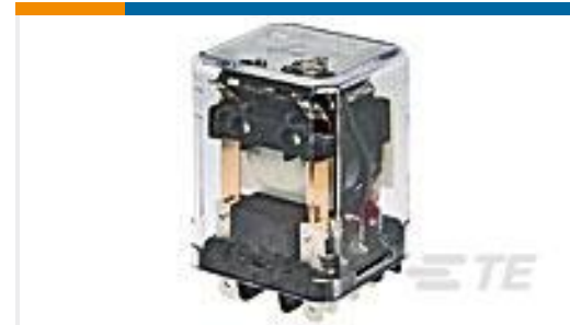
TE Part #8-1393113-3 KUEP-11A15-120=RELAY,GENPUR,QC