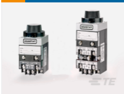
TE Part # 1-1423162-8 7022AK=RLY,STD,OFF,2P,120VAC,1