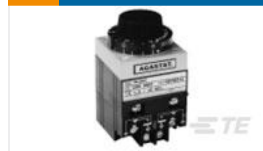
TE Part #2-1423159-3 7012PC=RLY,STD,ON,2P,125VDC,15