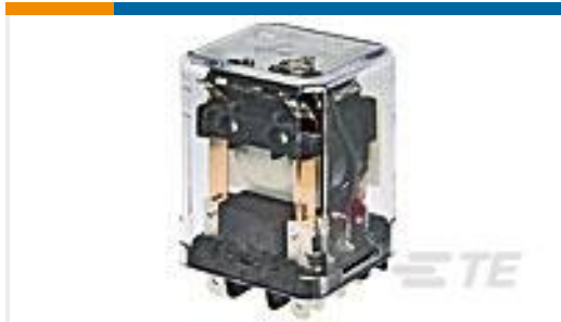
TE Part #1-1393114-1 KUEP-7D15-24=KU