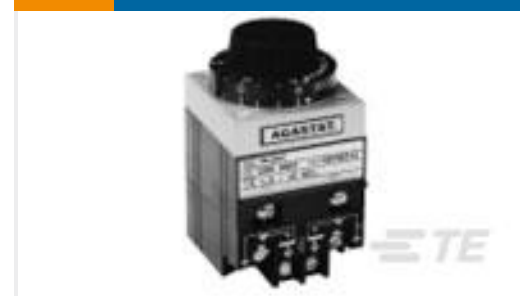
TE Part #2-1423164-2 7022PD=RLY,STD,OFF,2P,125VDC,5