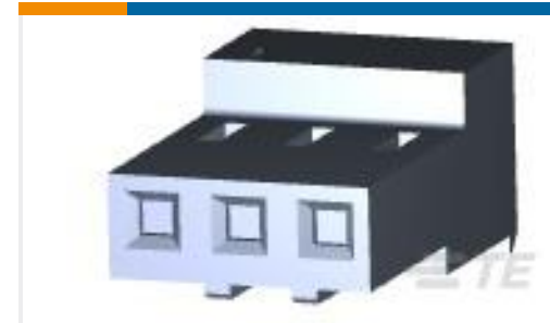
TE Part #3-640432-3 03P MTA156 CONN ASSY 20AWG YEL