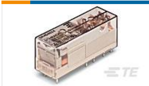
TE Part #4-1415053-1 SR4M4024