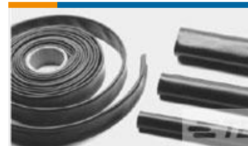
TE Part #CB5033-000 BSTS-13X25/CL