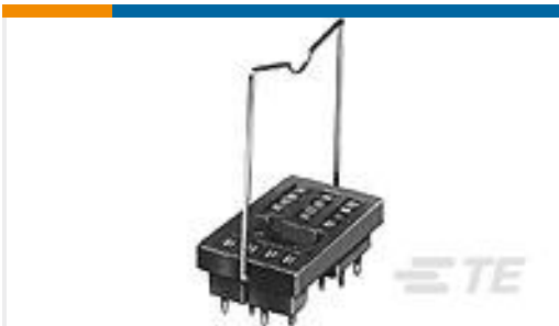
TE Part #3-1393159-7 20C251=SPRING,HOLD-DOWN,R10,0