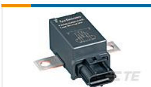
TE Part #1-1414939-4 V23130C2021A412-EV-CBOX