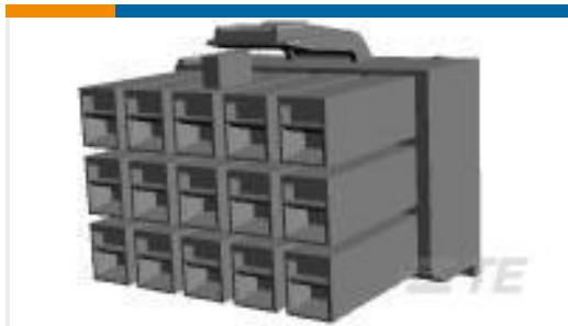
TE Part #176279-1 UNIV POWER PLUG HSG 15P F/H