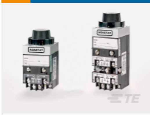
TE Part # 3-1423159-3 7012PJ=RLY,STD,ON,2P,125VDC,1