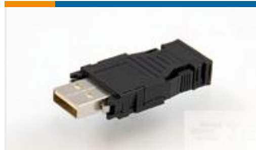
TE Part #2040305-1 INDUSTRIAL USB PLUG KIT BULK PACK STYLE