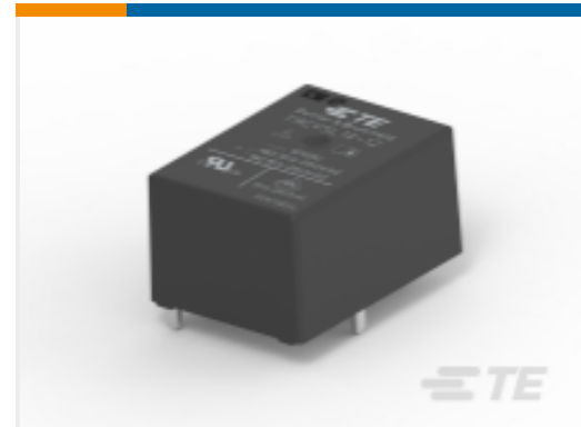
TE Part #1558665-8 T9GS5L14-48