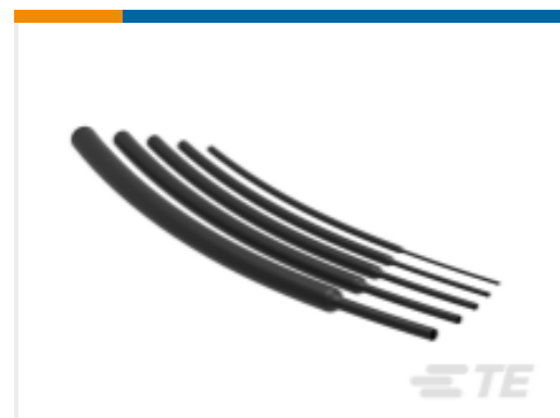
TE Part #NB20044001 VERSAFIT-1/4-0-SP-SM