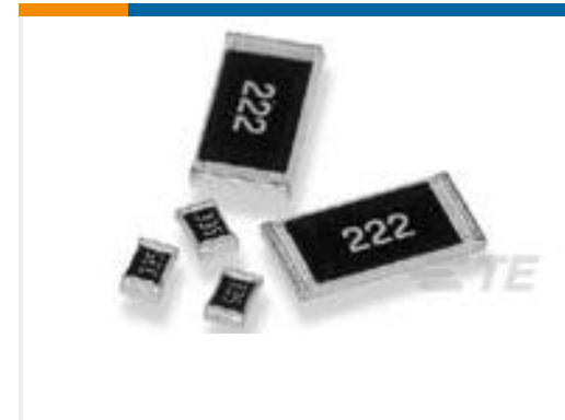
TE Part #8-1879494-9 CRGH0603 5% 4K7 0.2W