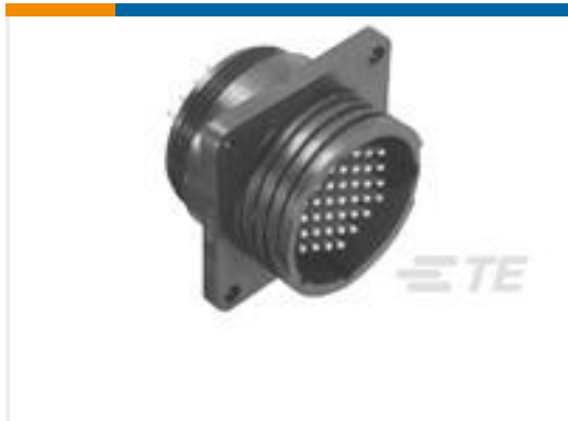
TE Part #1-207303-4 CPC RECPT ASSM SIZE 17-16