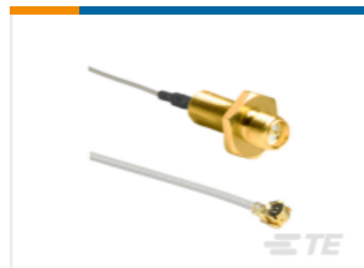
TE Part #CSI-RGFE-200-UFFR RP-SMA to U.FL/MHF1 200mm 1.13 OD