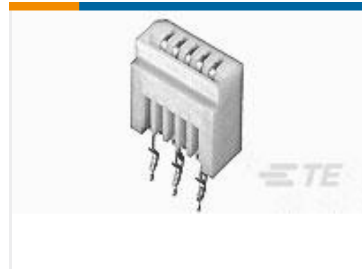
TE Part #84984-8 1mm FFC DIP V ASSY 8P NAT(TB)