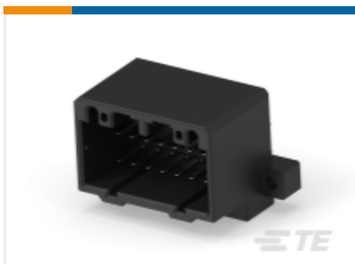
TE Part #9-1456610-2 16P 040 VERT HYBRID CAP ASSY