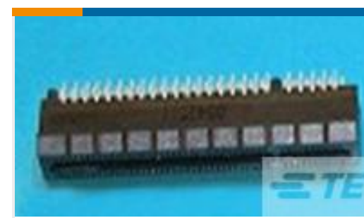
TE Part #5650118-1 CONN SEC II 15 POS 100C/L R/A