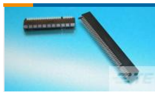
TE Part #5145274-1 CONN SEC II 13 POS 100C/L