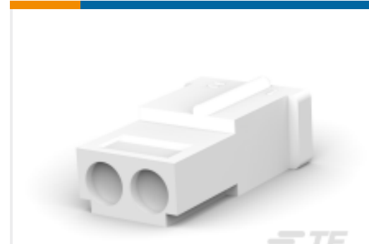
TE Part #2-480318-0 02P CMNL PLUG HSG F/H NATL V0