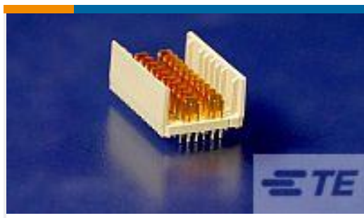
TE Part #1469025-1 HM-ZD 2PR HDR 40P 2.5MM