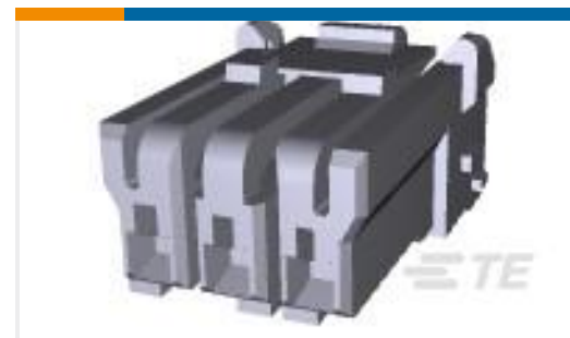
TE Part #3-1565082-4 GRACE INERTIA CONNECTOR 3.5 3P