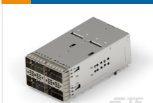
TE Part #2301859-7 ZQSFP+ STACKED RECEPTACLE ASSEMBLY 2X2