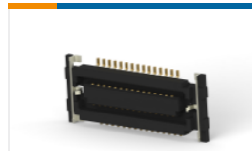
TE Part #3-5353512-0 ON TAPING (EMBOSS) 0.5MM FS CONN. REC. A